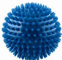
Massage ball, 10 cm (4"), blue