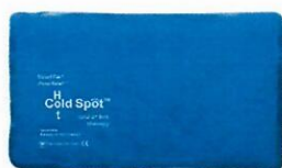
Relief Pak Cold n' Hot SensaFlex compress, medium

BSN SPORTS, LLC PO BOX 7726 DALLAS, TX 75209-0726