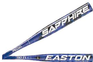
EASTON Easton Sapphire Fastpitch Bat (-12) 2025