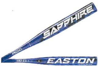
EASTON Easton Sapphire Fastpitch Bat (-12) 2025