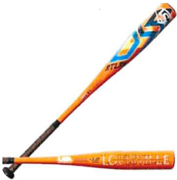
Louisville Slugger Atlas USA Youth Bat (-12)