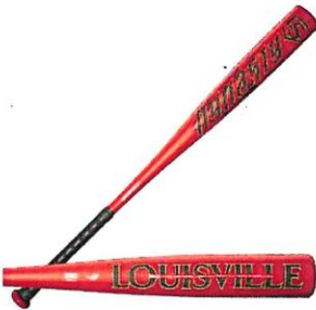
LOUISVILLE SLUGGER Louisville Slugger Dynasty BBCOR Baseball Bat (-3) 2025