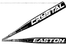
EASTON Easton Crystal Fastpitch Bat (-13) 2025