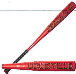
LOUISVILLE SLUGGER Louisville Slugger Dynasty BBCOR Baseball Bat (-3) 2025