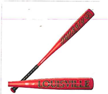
LOUISVILLE SLUGGER Louisville Slugger Dynasty BBCOR Baseball Bat (-3) 2025