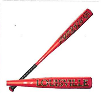
LOUISVILLE SLUGGER Louisville Slugger Dynasty BBCOR Baseball Bat (-3) 2025