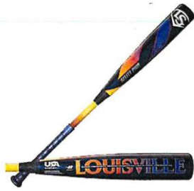
LOUISVILLE SLUGGER Louisville Slugger Select Power USA Baseball Bat (-8) 2025