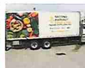
Mobile Food Market