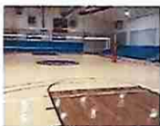
Avondale Gym Floors