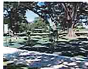
Waggaman Exercise Equipment

Councilman Byron L. Lee is proud to share District 3's progress, including increasing access to fresh food, sponsoring food drives, and enhancing safety with crime and railroad crossing cameras. In Waggaman, we established the Blue Star Memorial honoring our Armed Forces and installed new exercise equipment in parks and the Waggaman Pavilion to promote wellness.