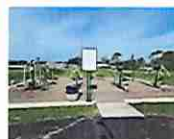
Kennedy Heights Exercise Equipment

I am proud to highlight projects transforming District 3. From the state-of-the-art library in Avondale to the new park in Waggaman, we are creating vibrant spaces for all. Improvements include fencing at Kennedy Heights gym, welcome signs in Avondale and Waggaman, outdoor exercise equipment and a test lot in Claiborne Gardens, and new floors at Avondale and Kennedy Heights gyms. These projects reflect our dedication to enhancing quality of life and providing valuable resources.