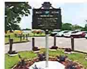
Waggaman Blue Star Memorial