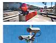
Railroad and Crime Camera's

Since taking office in 2020, I have been honored in receiving bids in our District have the opportunity to flourish academically, athletically, and socially. I am proud to continue to sponsor, annual Summer Swimming Lesson (adults included), an annual Summer Soccer Camp, Golf Lessons, funding to numerous schools for tutoring, and uniforms for various activities (Football, Basketball, band uniforms, equipment, dance/cheer uniforms). I also work with and assist many non-profits within District 3 who have visible projects that benefit residents of District 3.