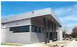
Avondale Library Coming Soon!

I am proud to highlight projects transforming District 3. From the state-of-the-art library in Avondale to the new park in Waggaman, we are creating vibrant spaces for all. Improvements include fencing at Kennedy Heights gym, welcome signs in Avondale and Waggaman, outdoor exercise equipment and a test lot in Claiborne Gardens, and new floors at Avondale and Kennedy Heights gyms. These projects reflect our dedication to enhancing quality of life and providing valuable resources.