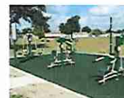
Avondale Exercise Equipment