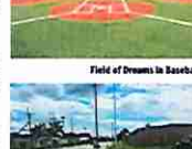
Decorative Lighting on Ames Blvd