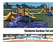
Claiborne Gardens Test Lot &amp; Exercise Equipment in Westwego

Of Note: I've established a Scholarship Fund for District 3 residents who have an interest in attending Southern University in New Orleans. Please call our office for additional information.