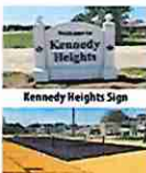
Kennedy Heights Sign