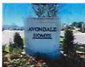
Avondale Neighborhood Sign