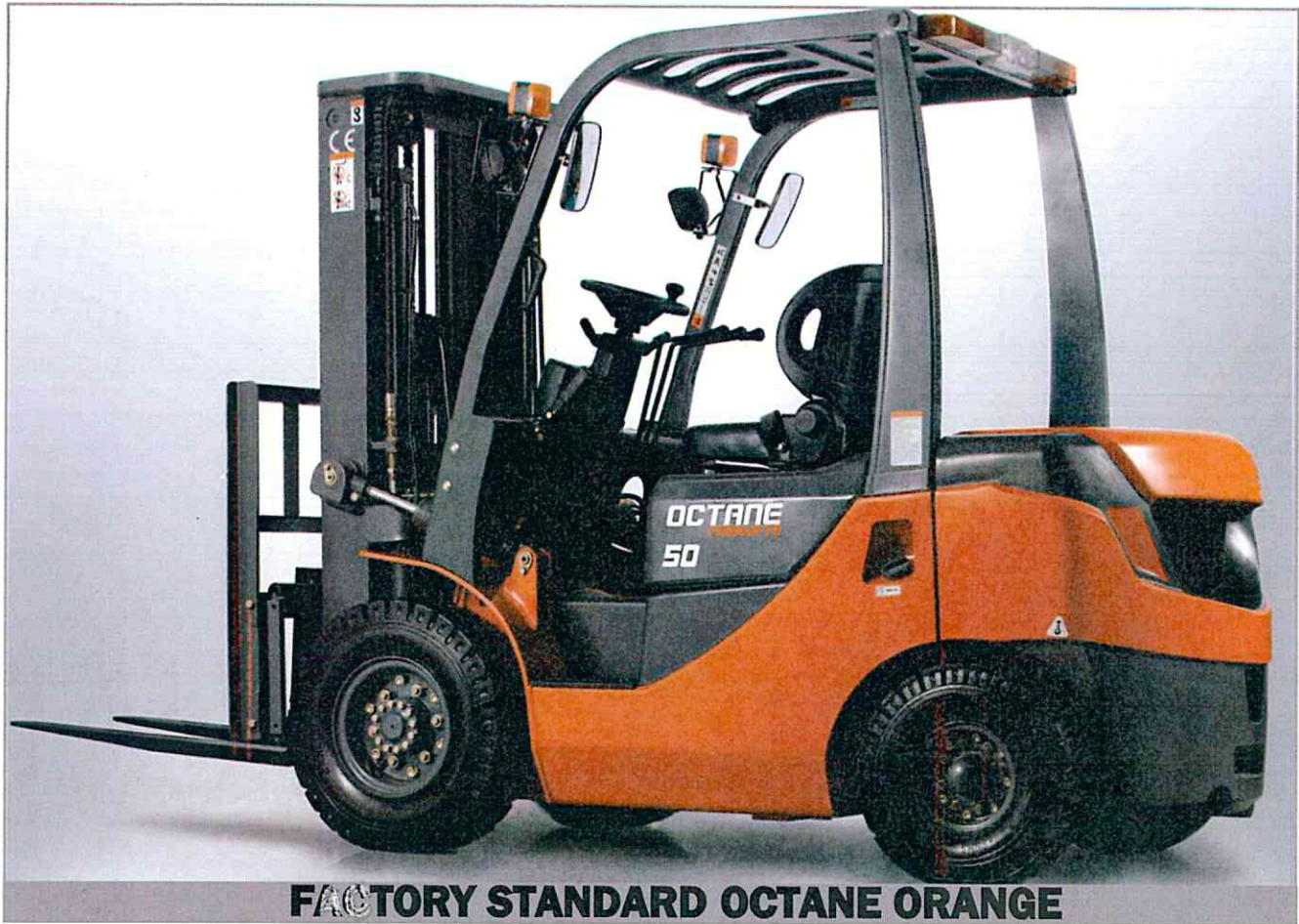
FACTORY STANDARD OCTANE ORANGE