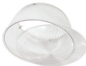
Polycarbonate Lens & Cover Sold Separately