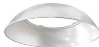
60° & 120° Aluminum Reflectors Sold Separately