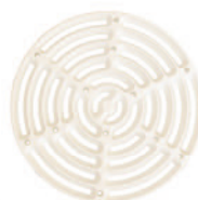
90° Directed Optics Lens Sold Separately