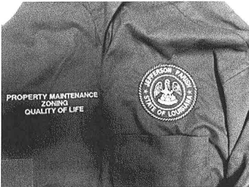
Logo on the Left