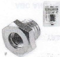
Angle Grinder Adapter 5/8"-11 M10x1.5mm