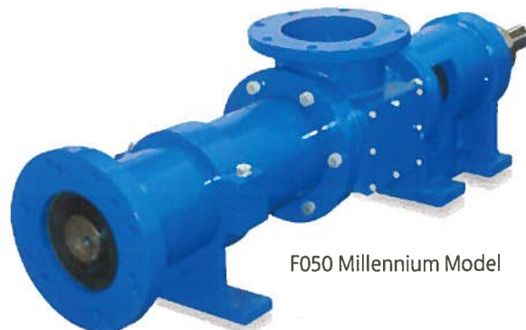
F050 Millennium Model

Liberty Process Equipment, Inc. 2525 South Clearbrook Drive Arlington Heights, IL 60005 Phone: (847) 640-7867 Fax: (847) 640-7855 www.libertyprocess.com