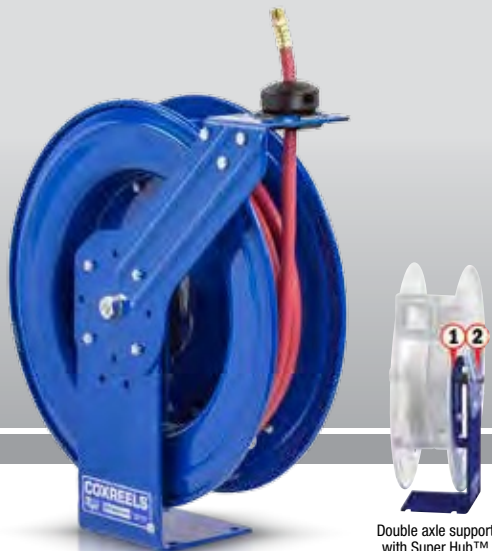
Double axle support with Super Hub™

COXREELS® SH Series "Super Hub™" spring driven hose reels, like the P Series, have a long history of dependable performance. The larger chassis and frame accommodate longer lengths and larger diameters of hose. Coxreels' original Super Hub™ dual axle support system increases the stability during operation, reduces vibration and strengthens the structural integrity of the reel.