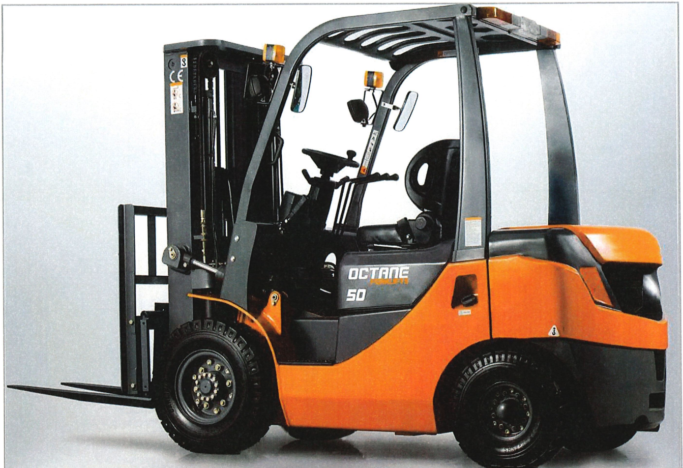
FACTORY STANDARD OCTANE ORANGE