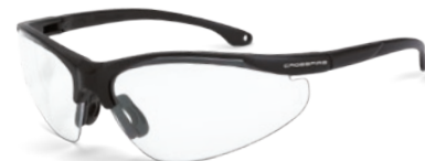
1734 - Clear Lens Matte Black Frame