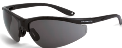
1731 - Smoke Lens Matte Black Frame