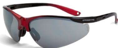
1733 - Silver Mirror Lens Shiny Black/Red Frame