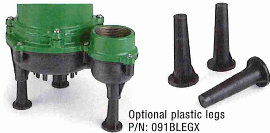
Optional plastic legs P/N: 091BLEGX