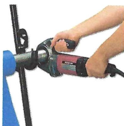
Electric Power Winder

BSN SPORTS, LLC PO BOX 7726 DALLAS, TX 75209-0726