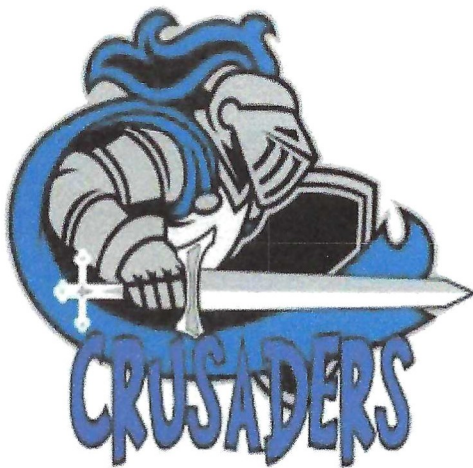
KINGS GRANT LOGO