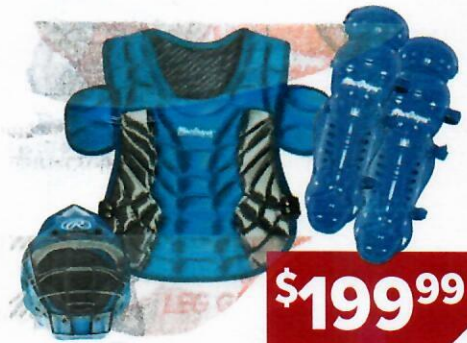
GIRL'S FAST PITCH CATCHER'S GEAR PACK

1184747 Adult Size $34 99 PR ★ 1184754 Youth Size $34 99 PR ★