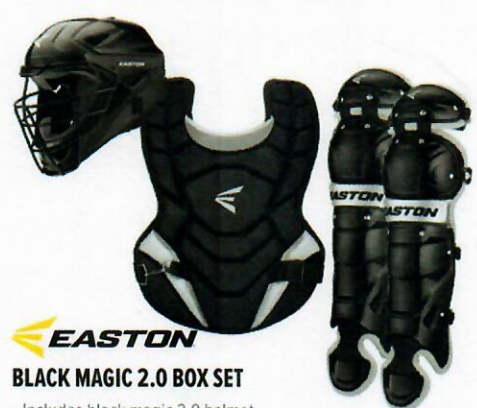
BLACK MAGIC 2.0 BOX SET