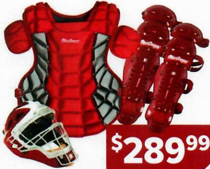
VARSITY FAST PITCH CATCHER'S GEAR PACK