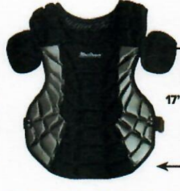
MCB70 PRO CHEST PROTECTOR