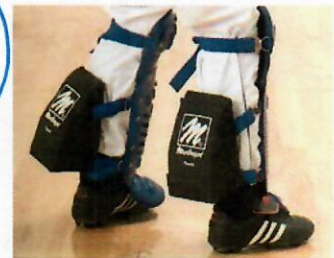
CATCHER'S KNEE SUPPORT