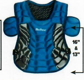
MCB80/81 FEMALE CHEST PROTECTORS

1298475 Varsity $69 99 EA ★ 1298505 Youth $59 99 EA ★