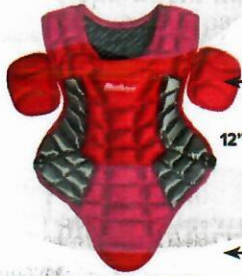
MCB75 JUNIOR CHEST PROTECTOR