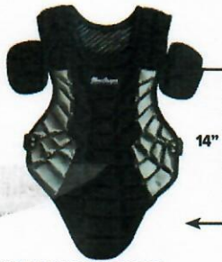
MCB74 YOUTH CHEST PROTECTOR