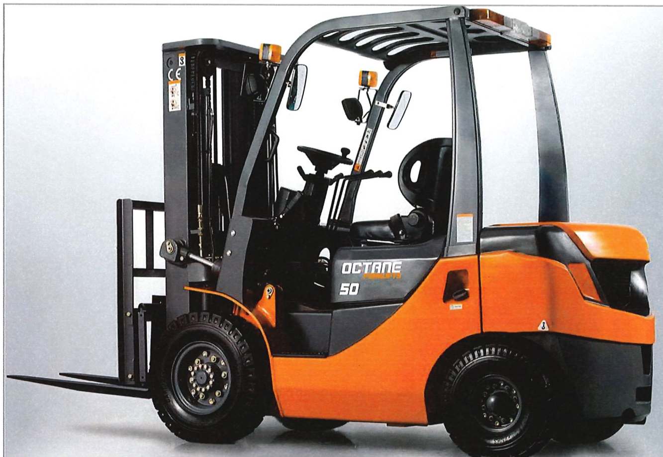
FACTORY STANDARD OCTANE ORANGE