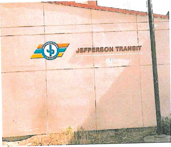
Item #2 - Building Side Qty. 1 - 52.5" x 24" Logo Sign