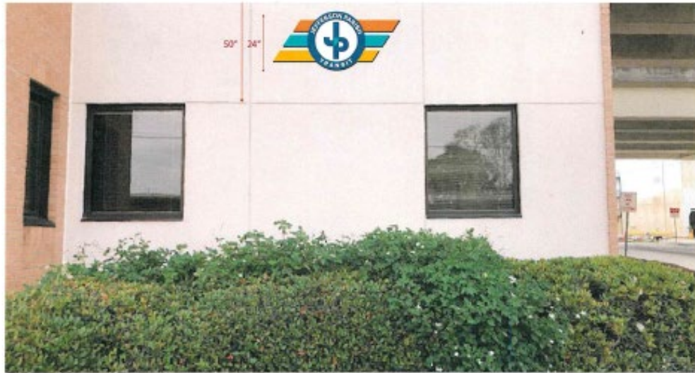
Item #2 - Building Back Qty. 1 - 52.5" x 24" Logo Sign