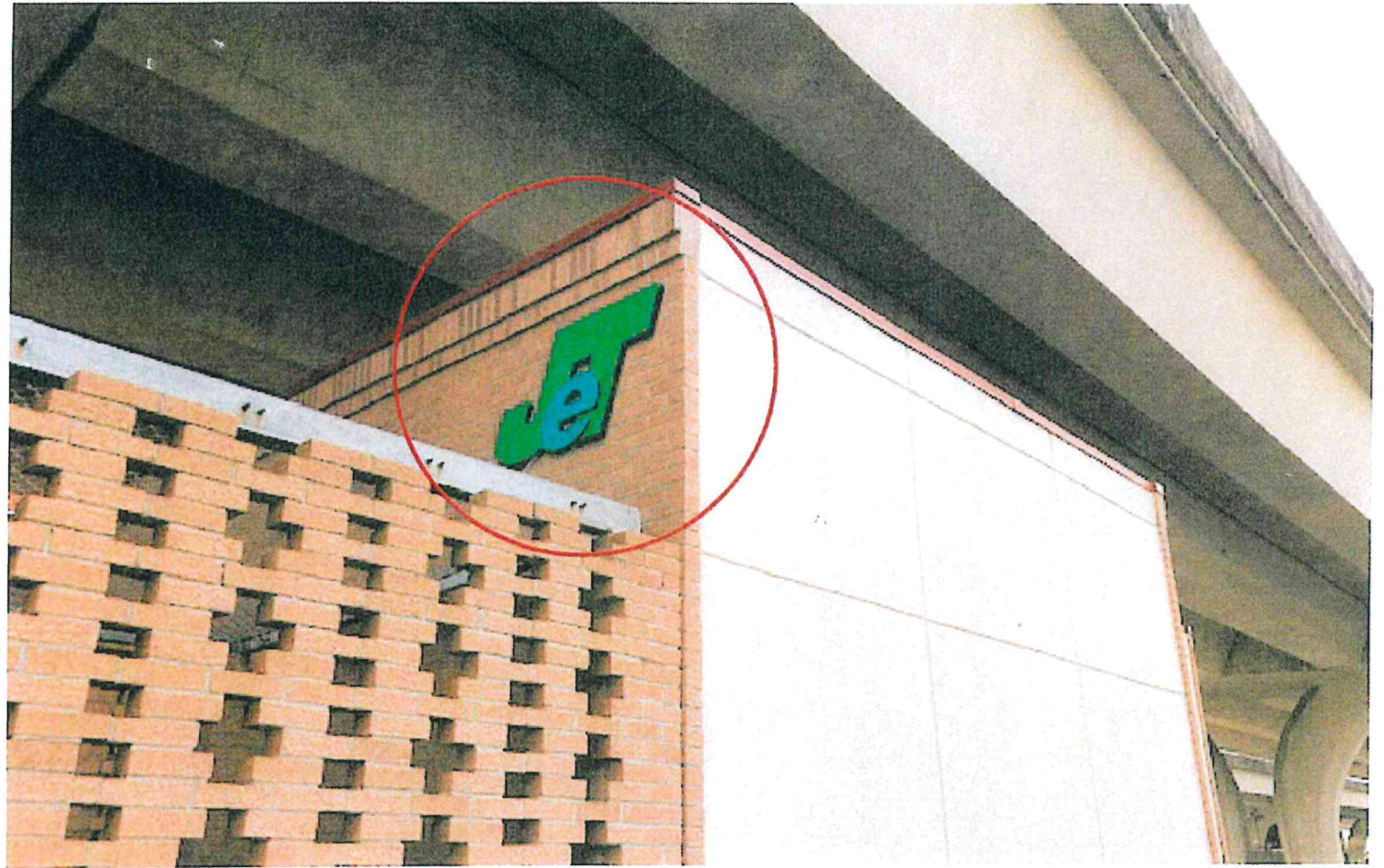
Item #4 - Removal Only