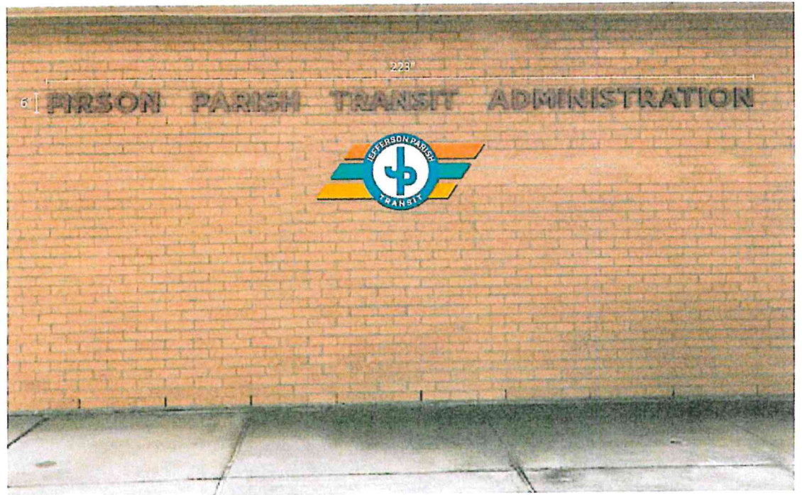
Item #1 - Building Front Qty. 1 - 52.5" x 24" Logo Sign