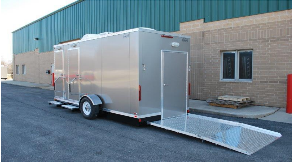
3 Station Handicap Accessible Restroom Trailer with Hydraulic Lowering ( 16' Model )

Example of Basic Interior (White FRP) with coin rubber and wash down package