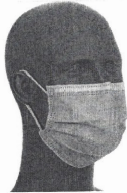
Disposable Face Mask With Ear Loops, Blue, 3-Ply, 50/Box