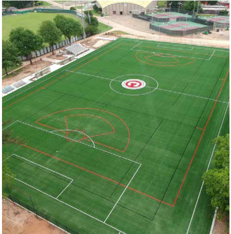
Shreveport, LA - Mayo Field at Centenary College of Louisiana