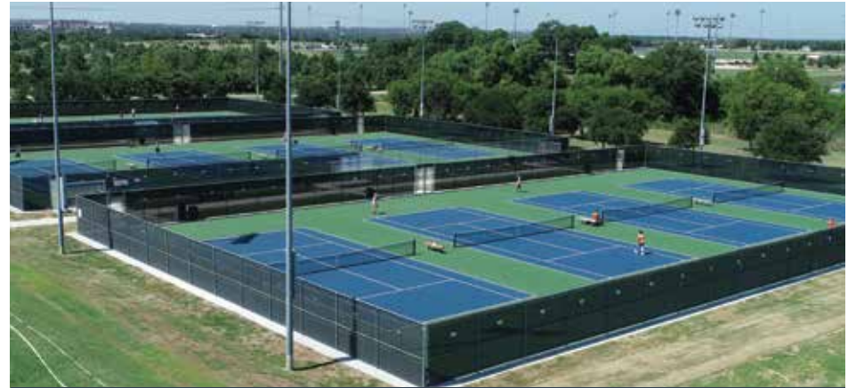
Roundrock, TX - Old Settler's Park Tennis Facility