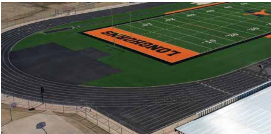
Alex, OK - Longhorn Track