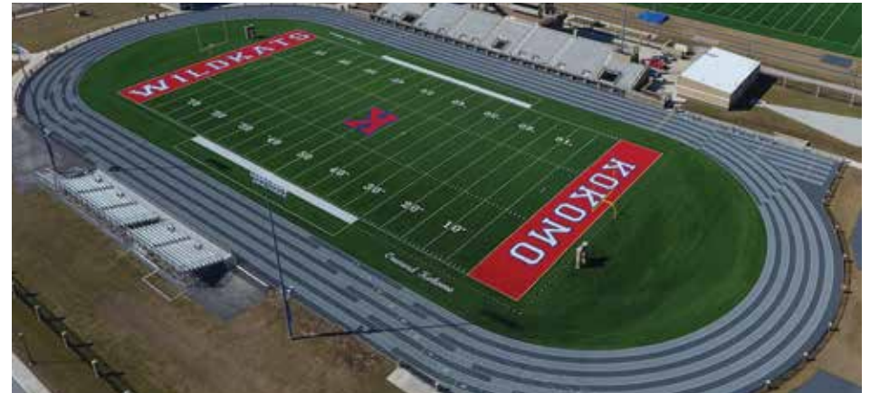
Kokomo, IN - Walter Cross Track