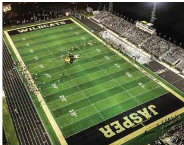
Jasper, IN - Jerry Brewer Stadium Field