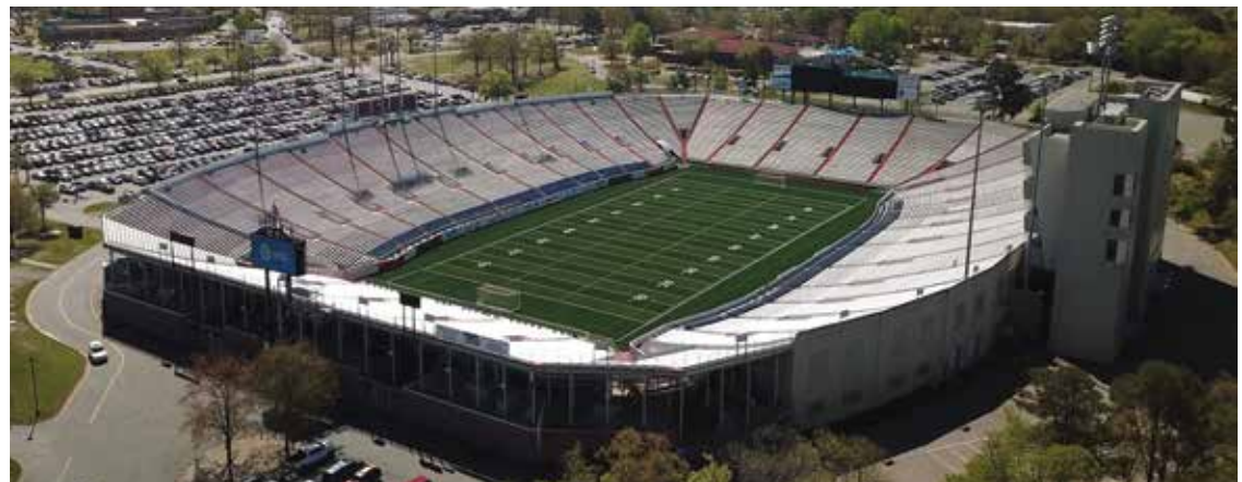
Little Rock, AR - War Memorial Stadium