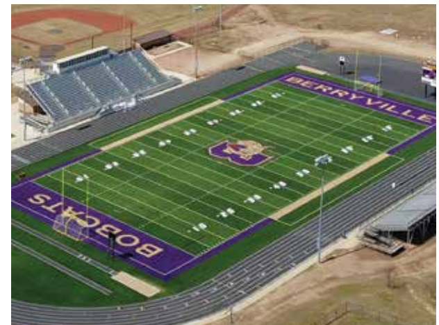
Berryville, AR - Berryville Track & Field