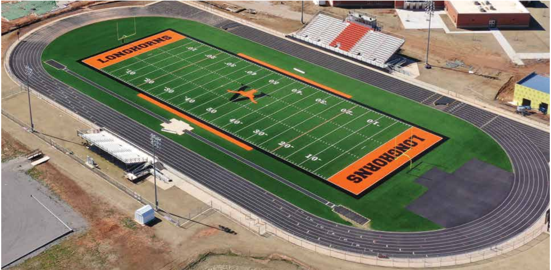
Alex, OK - Longhorn Field & Track