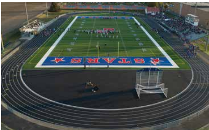
Thorntown, IN - Western Boone Track & Field