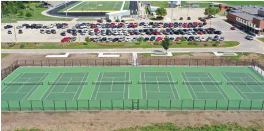
Des Moines, IA - Saydel Community School District - Tennis Facility