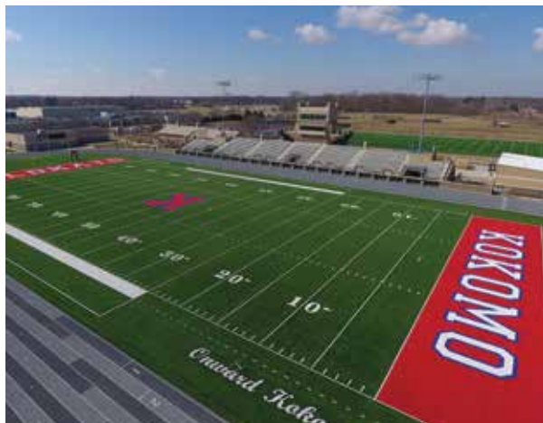
Kokomo, IN - Walter Cross Field and Track