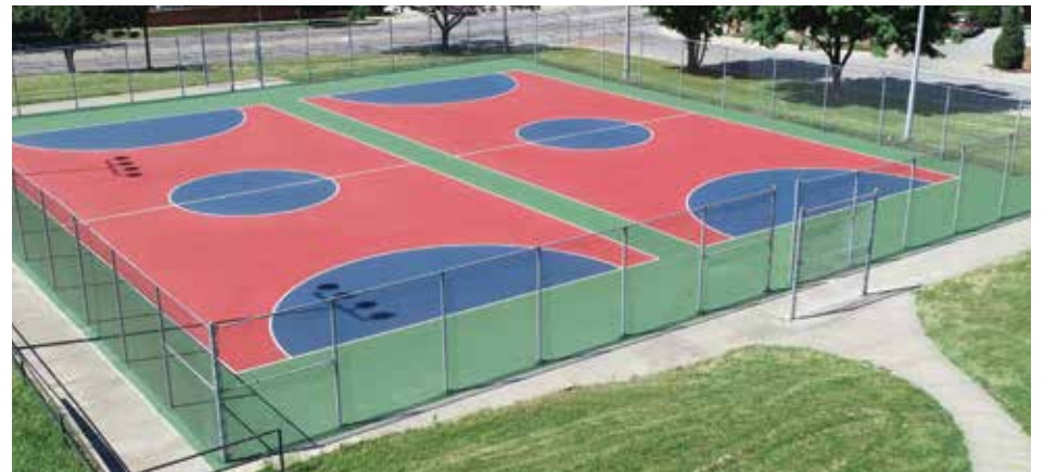
Kansas City, MO - Prospect Plaza Futsal Facility