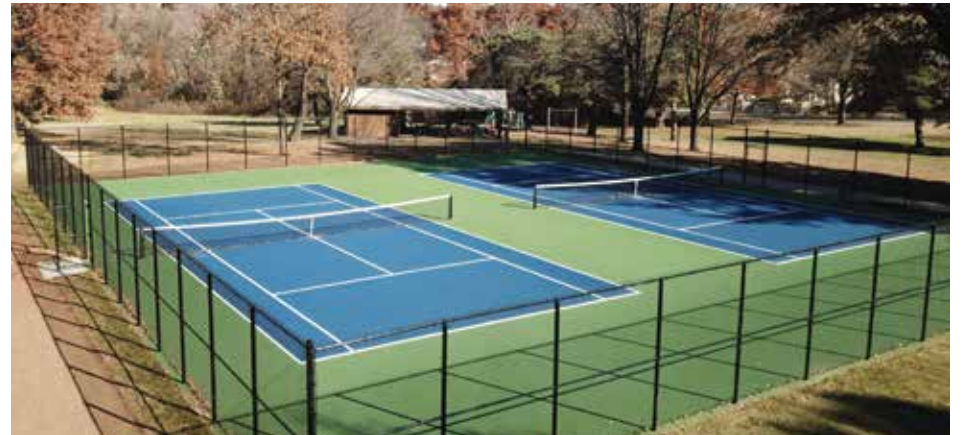
Overland Park, KS - Brookridge Tennis Courts