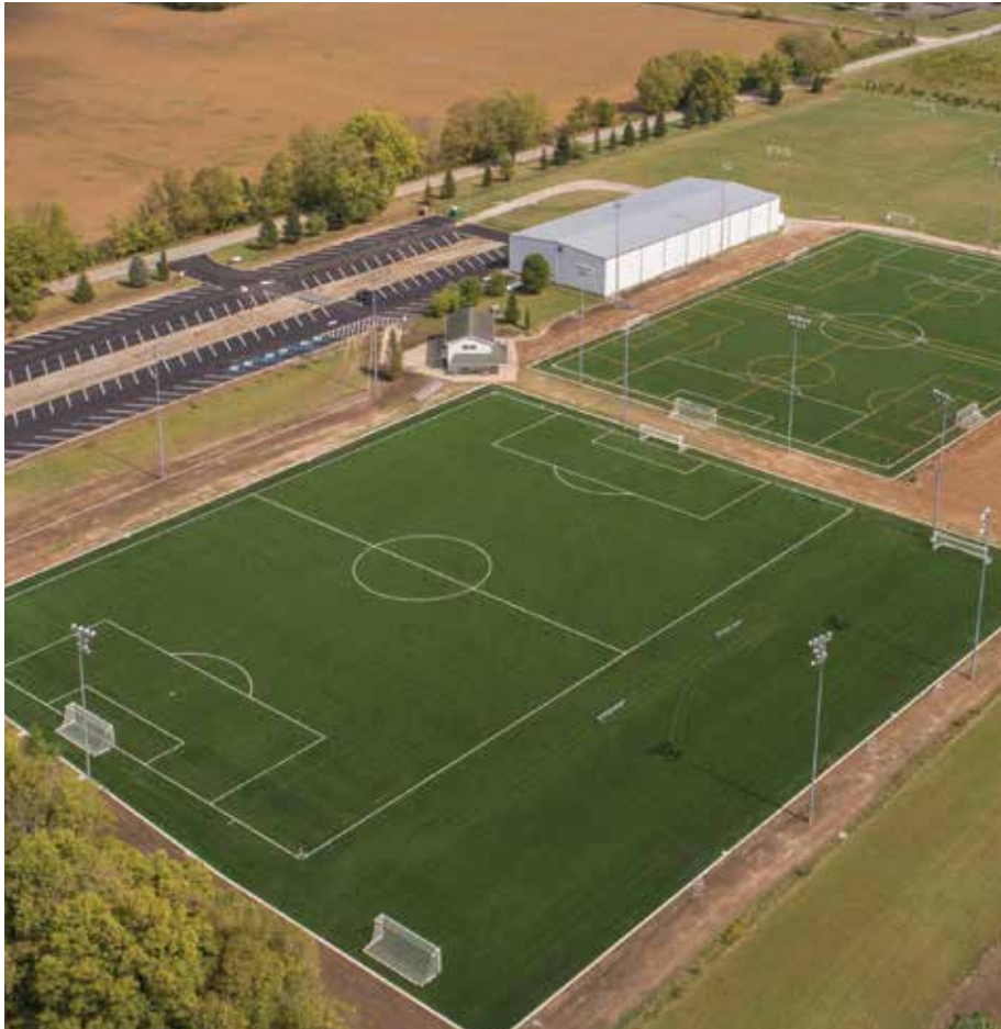
Indianapolis, IN - Indy Premier Soccer Club