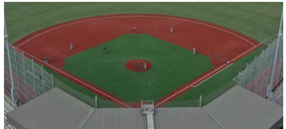
Ruston, LA - McMurry Park Softball Fields