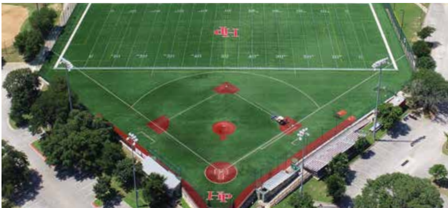
Austin, TX - Hyde Park Baseball, Football & Soccer Field