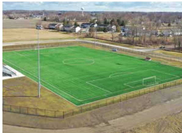
Nappanee, IN - Nappanee Soccer Complex