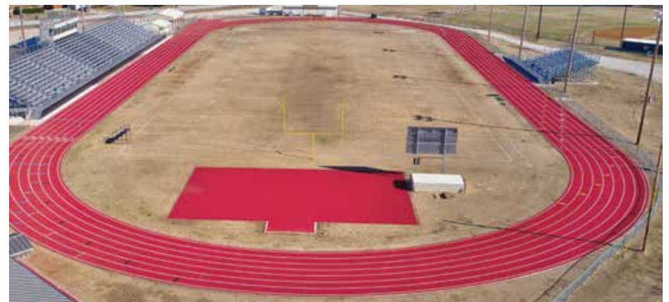
Marietta, OK - Marietta High School Track