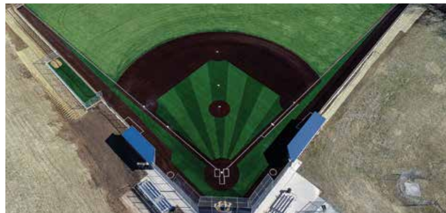
Independence, MO - William Chrisman Baseball Fields