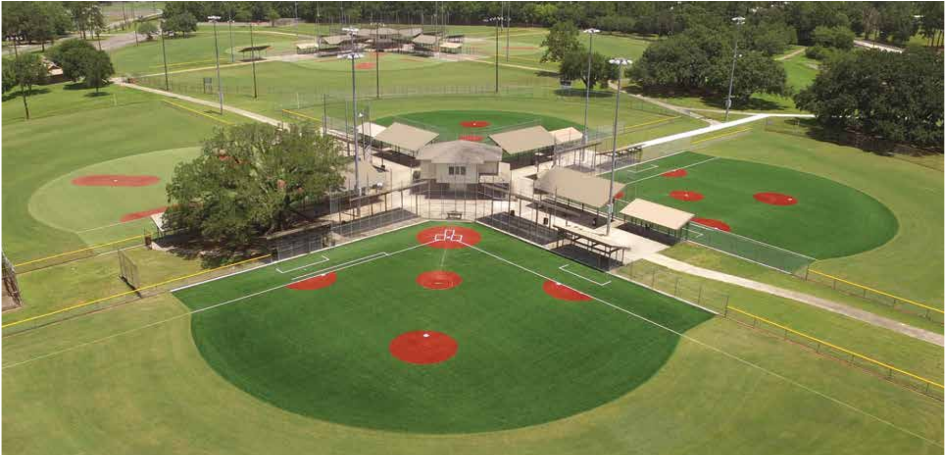
Ruston, LA - Pattison Park Softball Fields