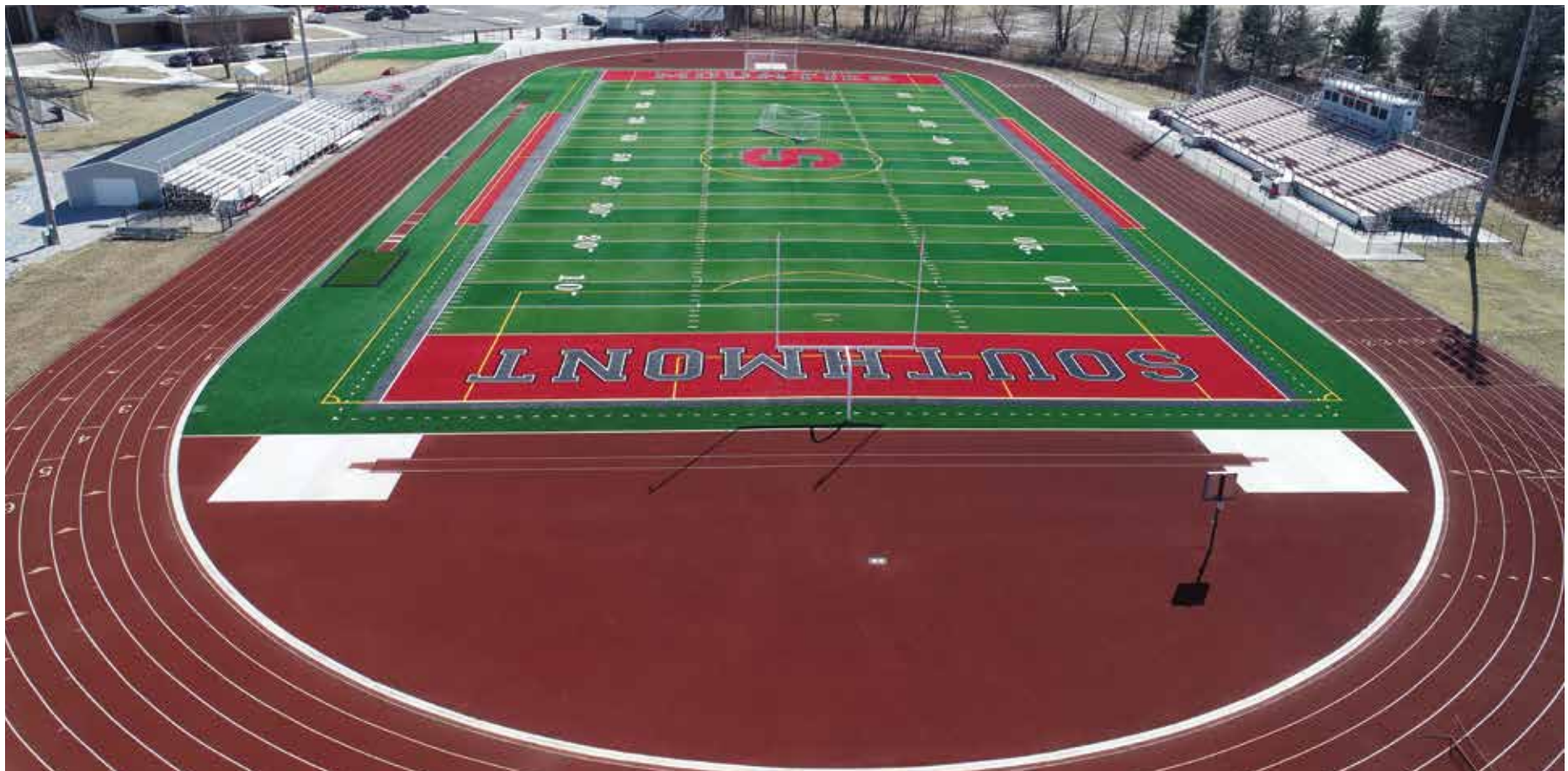
Crawfordville, IN – Stadium Field & Track