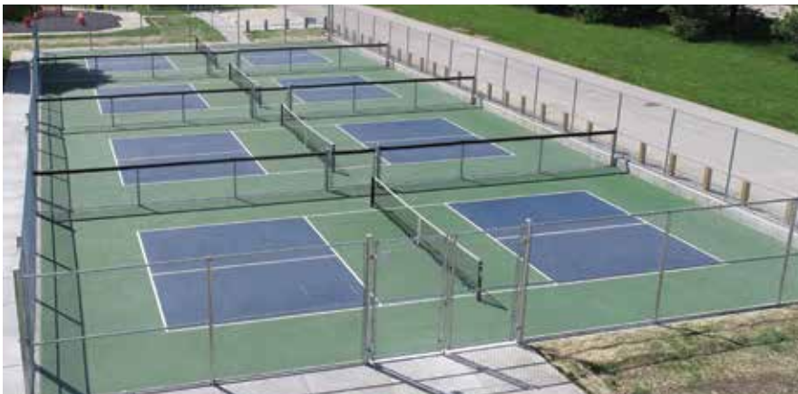
Lincoln, NE - Peterson Park Pickleball