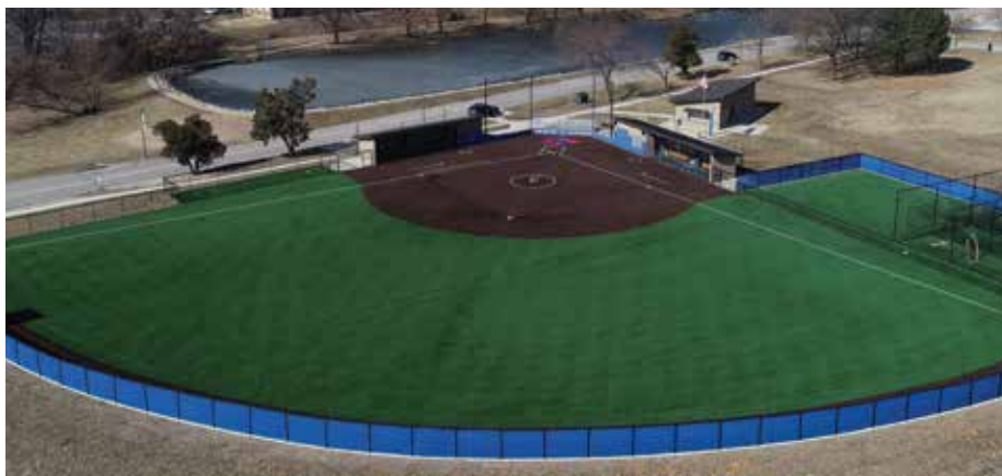
Kansas City, KS - KCKCC Softball Field