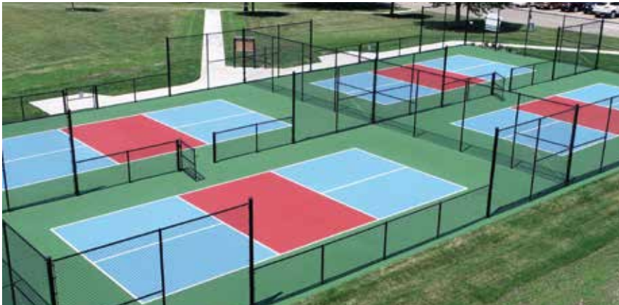
Okiboji, IA - Speier Park Pickleball