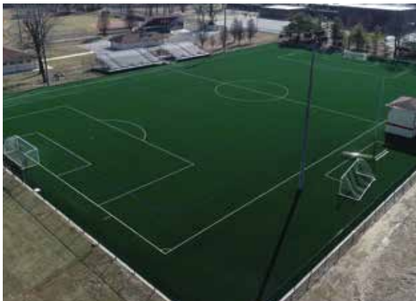
Greenwood, IN - Soccer Complex