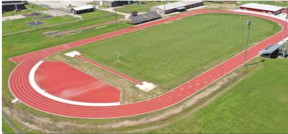
Coffeyville, OK - Oklahoma Union High School Track