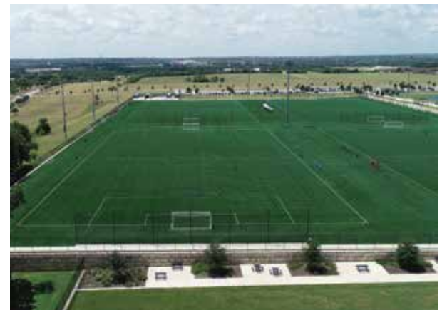
Austin, TX - Old Settler's Park Soccer Complex