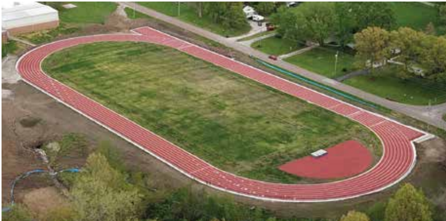
Plattsburg, MO - High School Track