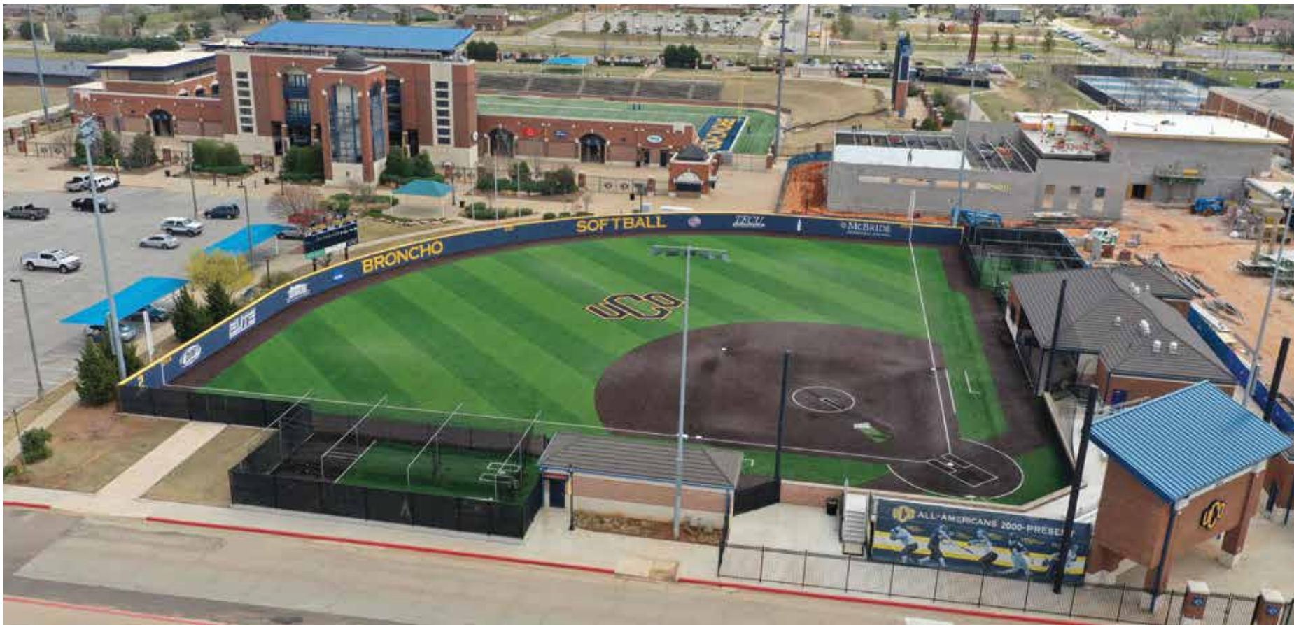
Edmond, OK - UCO Baseball Field