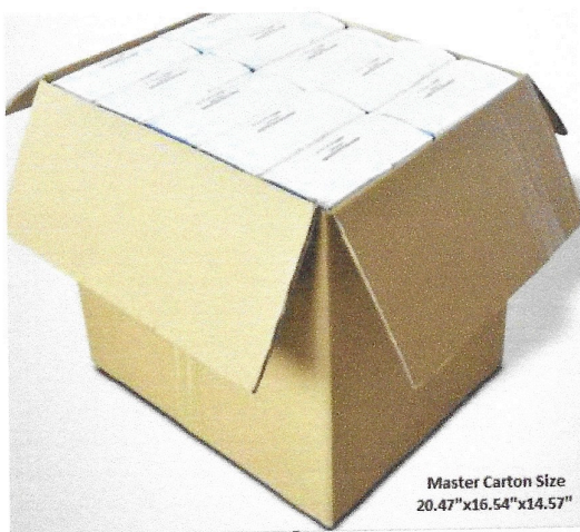
Master Carton Size 20.47"x16.54"x14.57"