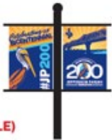
SECONDARY BANNER (USE AS THE DOUBLE)

PROOF – JP BICENTENNIAL BANNER [Design B – SIZE: 24" x 36"]