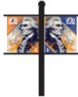
SECONDARY BANNER (USE AS THE DOUBLE)

PROOF - JP BICENTENNIAL BANNER [Design A - SIZE: 20" x 24"]