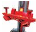
Light truck adapter #MCOLTA