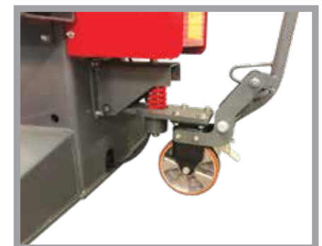
▲ Pallet Jack or Spring-Loaded Steering ( Optional )