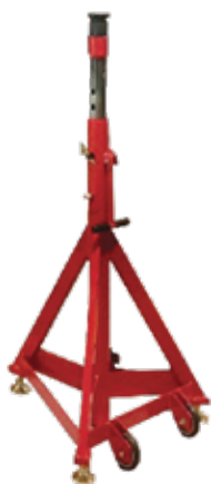
Adjustable wheels stands #MCOAWS-19-54-83