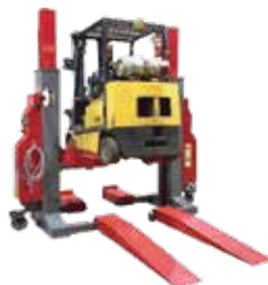
Fork lift adapter #MCOFLA