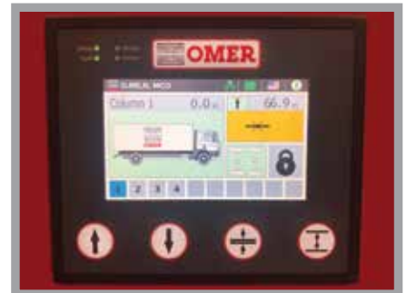
▲ Color LCD Interactive Display