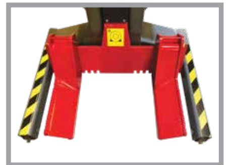
▲ Low Profile Adjustable Forks