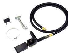
Auxiliary Bead Sealer (ABS) (PN 85606545)