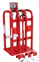
EL-X Express Lane® Inflation System (PN 85607770)