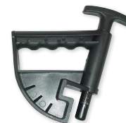
Manual Drop Center Tool (PN 8435685)