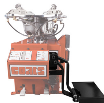
Point-of-Use Lift System (PN 85608609)