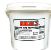
Paste Lube Bucket (PN 8183710)