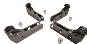
Grip-Max® Plus 28" Clamps (PN 85607986)