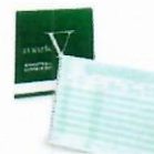
MARK V BASKETBALL SCOREBOOK