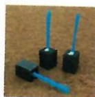
BIG LEAGUE BASE PLUGS (3-PACK)