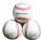
MARK 1 OFFICIAL LEAGUE BASEBALL