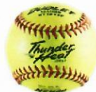
DUDLEY WT12Y-FP 12" FAST PITCH