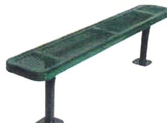
6' BENCH - PERFORATED