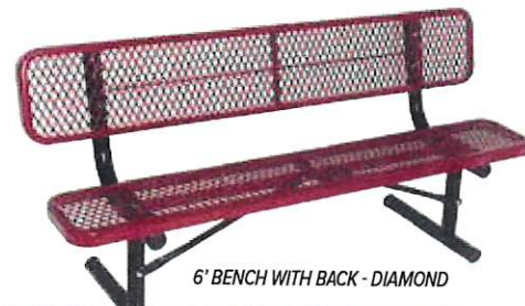
6' BENCH WITH BACK - DIAMOND