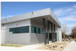
Avondale Library Coming Soon!

I am proud to highlight projects transforming District 3. From the state-of-the-art library in Avondale to the new park in Waggaman, we are creating vibrant spaces for all. Improvements include fencing at Kennedy Heights gym, welcome signs in Avondale and Waggaman, outdoor exercise equipment and a tot lot in Clairborne Gardens, and new floors at Avondale and Kennedy Heights gyms. These projects reflect our dedication to enhancing quality of life and providing valuable resources.