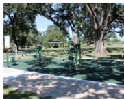
Waggaman Exercise Equipment

Councilman Byron L. Lee is proud to share District 3's progress, including increasing access to fresh food, sponsoring food drives, and enhancing safety with crime and railroad crossing cameras. In Waggaman, we established the Blue Star Memorial honoring our Armed Forces and installed new exercise equipment in parks and the Waggaman Pavilion to promote wellness.