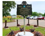
Waggaman Blue Star Memorial