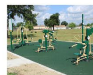
Avondale Exercise Equipment