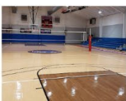
Avondale Gym Floors