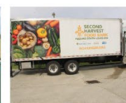
Mobile Food Market