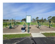
Kennedy Heights Exercise Equipment

I am proud to highlight projects transforming District 3. From the state-of-the-art library in Avondale to the new park in Waggaman, we are creating vibrant spaces for all. Improvements include fencing at Kennedy Heights gym, welcome signs in Avondale and Waggaman, outdoor exercise equipment and a tot lot in Clairborne Gardens, and new floors at Avondale and Kennedy Heights gyms. These projects reflect our dedication to enhancing quality of life and providing valuable resources.