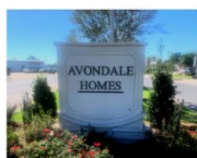
Avondale Neighborhood Sign