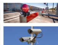
Railroad and Crime Camera's