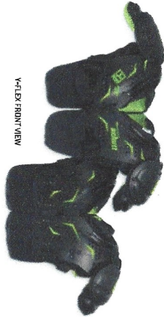
Y-FLEX FRONT VIEW