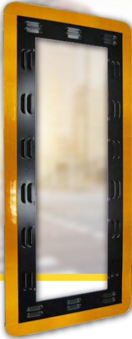
3-Section Louvered Version

CABINETS CONTROLLERS DETECTION PARKING SIGNALS SIGNS SOFTWARE SPECIALTY