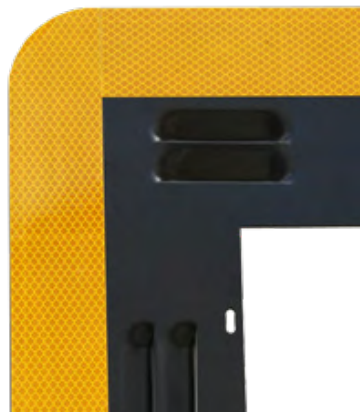
Close-up of Reflective Tape (aluminum louvered backplate)