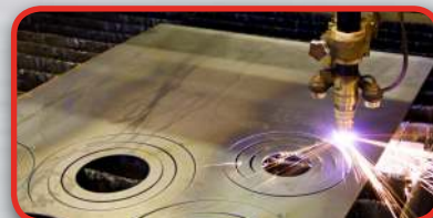
Cutting Tools Industry