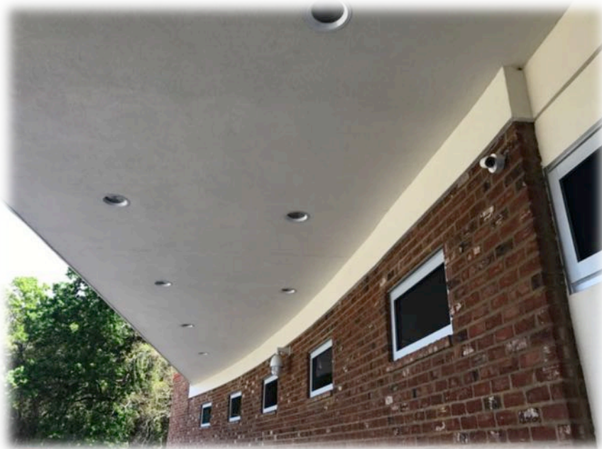
○ Stucco Ceilings