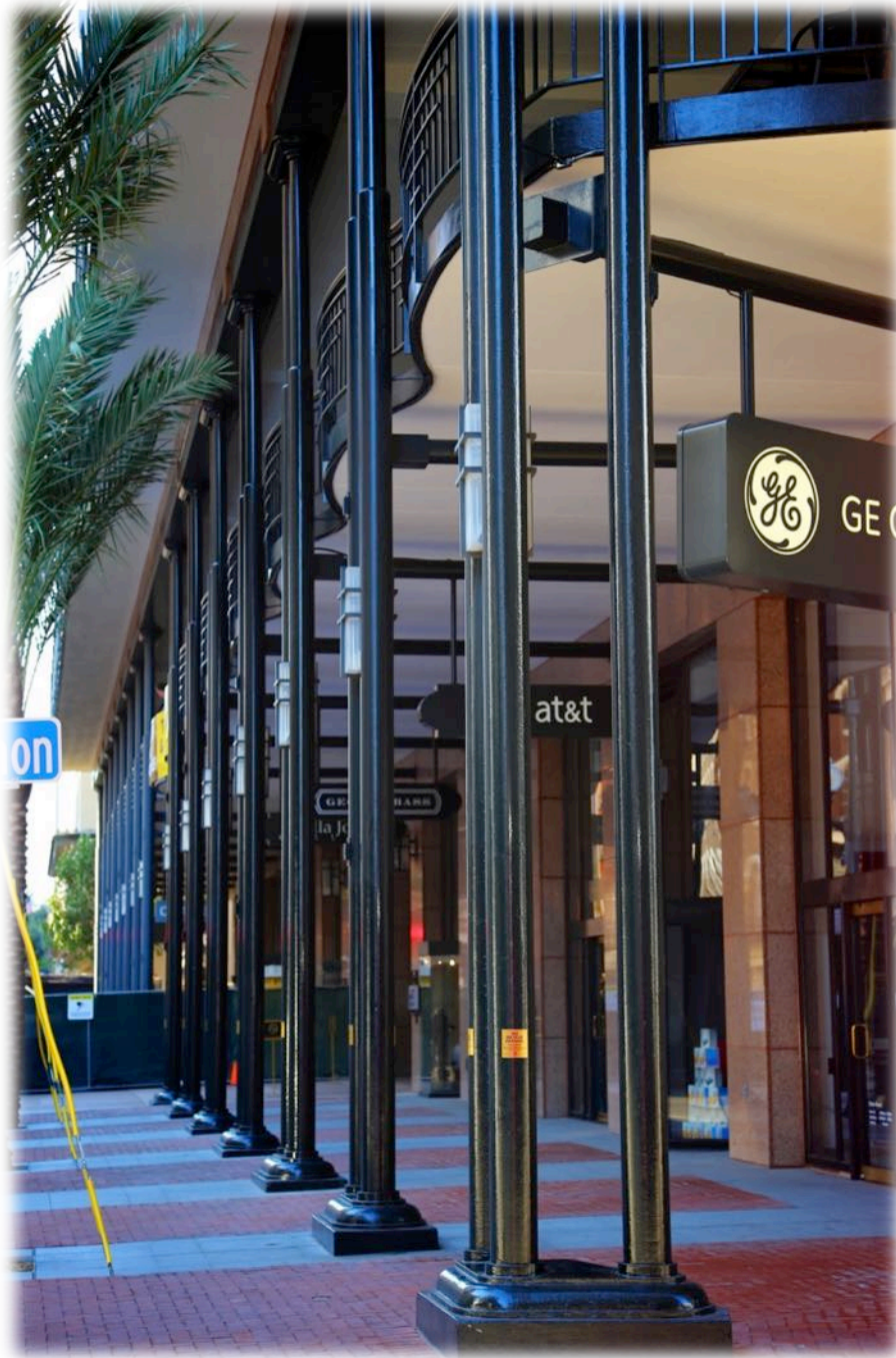
Place St. Charles New Orleans, LA