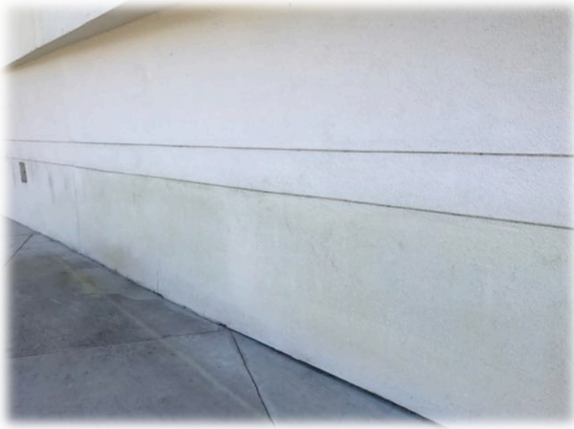
○ Stucco Walls