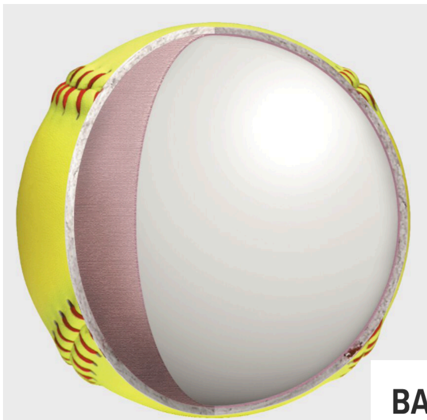
BABE RUTH OFFICIAL 11" SOFTBALLS