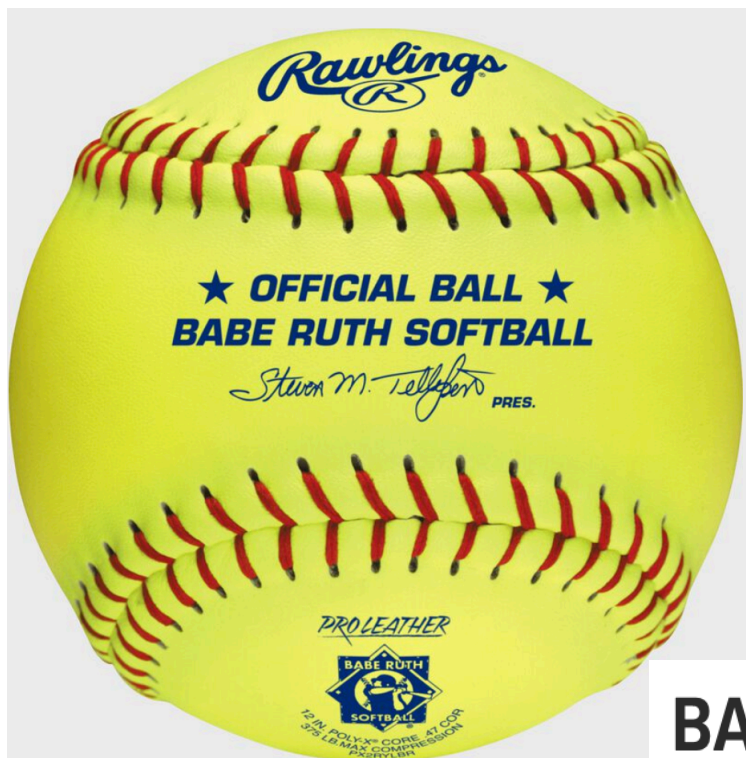
BABE RUTH OFFICIAL 12" SOFTBALLS