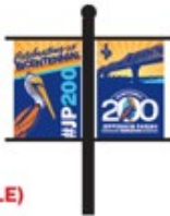
SECONDARY BANNER (USE AS THE DOUBLE)

PROOF – JP BICENTENNIAL BANNER [Design B – SIZE: 24" x 36"]