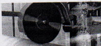
20" XTREME™ blade in action. at!

VBT™ allows for more diamond particles to be exposed on the core. This exposure produces the aggressive cutting action.