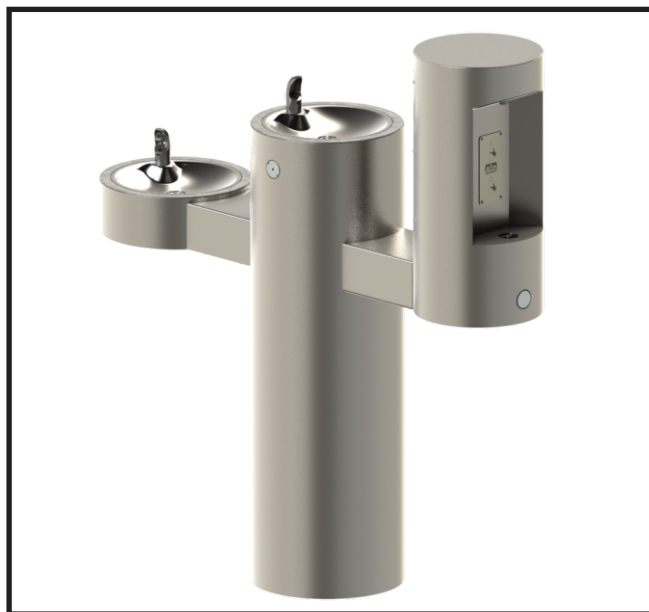
Model GYV34 Shown

Please visit www.murdockmfg.com for most current specifications.