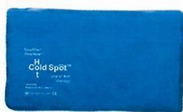
Relief Pak Cold n' Hot Sensaflex compress, medium

BSN SPORTS, LLC PO BOX 7726 DALLAS, TX 75209-0726