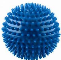
Massage ball, 10 cm (4"), blue