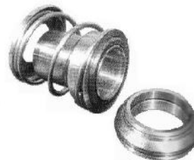
Self-aligning, oil lubricated, Mechanical seal with Silicon Carbide Rotating face and Tungsten Stationary.