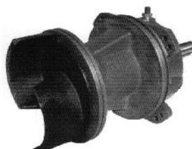
Removable Rotating Assembly