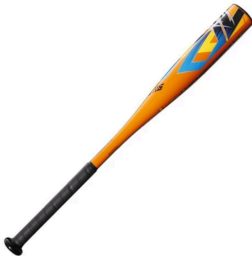
Louisville Slugger Atlas (-12.5) T-Ball Bat 3378-WBL2666010

Designed to maximize barrel control, the 2023 Atlas (-12.5) T-Ball Bat from Louisville Slugger features a complete alloy design in a lightweight frame. The one-piece construction maximizes stiffness and empowers young players with its easy, lightweight swing, and the Hub™ 1-shot end cap improves durability, making Atlas the ideal bat for the game's youngest sluggers.