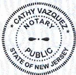
A NOTARY PUBLIC OF NEW JERSEY My Commission Expires Mar. 27, 2014

IN TESTIMONY WHEREOF, I have hereunto set my hand affixed my Official Seal, at the City of Newark, New Jersey the day and year first above written.