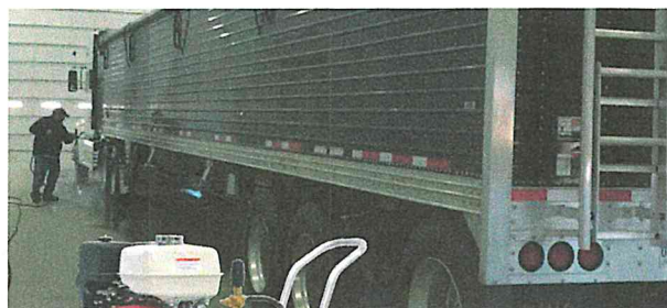
Direct-Drive HD Gas Cart (Available with optional skid mount feet)