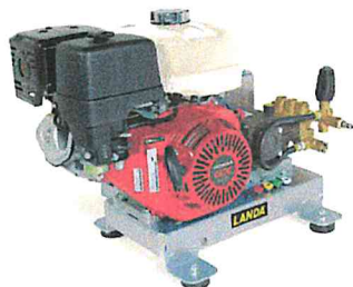
HD 4.0/40 GB shown with optional skid mount feet

■ 50 ft. of steel-wire braid High Pressure Hose with 24-inch Hose Guard for burst protection and swivel Crimp Fitting for tangle-free handling of hose and trigger gun.