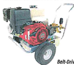
Belt-Drive HD Gas Cart

Compact and corrosion-resistant, the HD Gas aluminum pressure washers can be utilized as a cart or a skid (optional) for maximum cleaning versatility and durability. Easy to maneuver with puncture proof, flat free tires. These reliable Honda powered pressure washers offer a bypass loop for additional pump protection, as well as a 7-year warranty on the oil end of the pump. The simple design of the HD Gas helps get the job done quickly and without hassle. All models are ETL certified to UL safety standards.