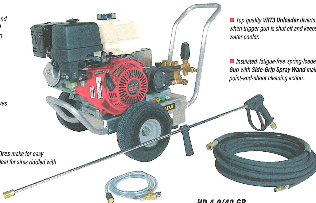
HD 4.0/40 GB

■ Insulated, fatigue-free, spring-loaded Trigger Gun with Side-Grip Spray Wand make for easy point-and-shoot cleaning action.