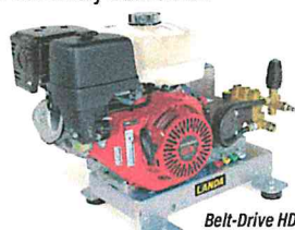
Belt-Drive HD Gas with optional skid mount feet