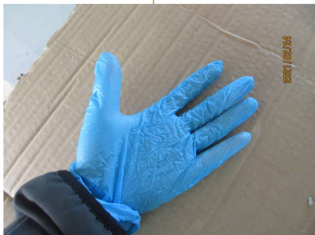
14 function test (5).JPG