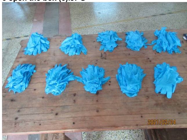
7 quantity check.JPG