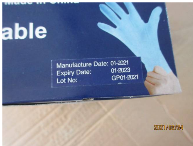
5 color box (6).JPG