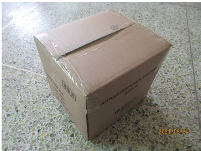
1 carton view.JPG