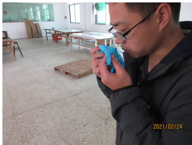
14 smell check.JPG