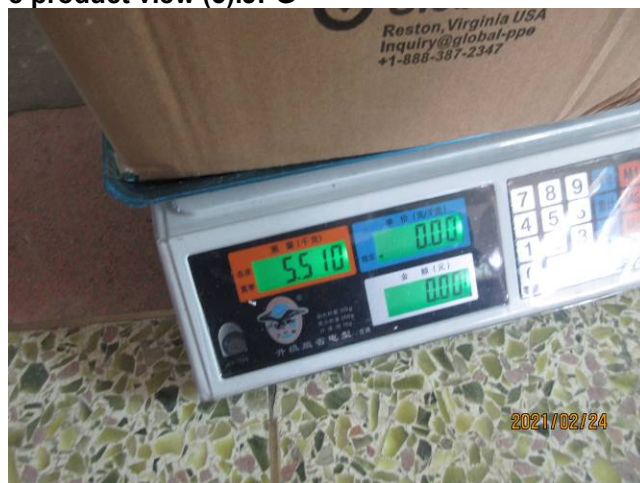
9 weight check (1).JPG