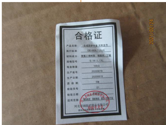
6 open the box (3).JPG