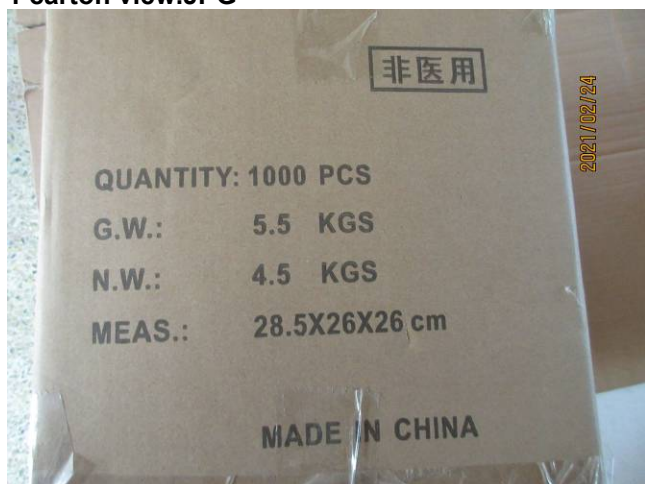
3 side mark.JPG