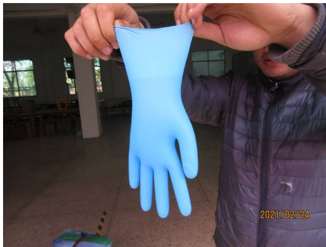
12 leakage test.JPG