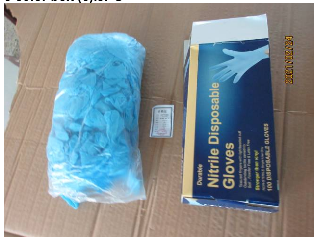
6 open the box (2).JPG