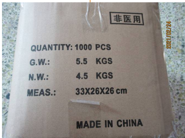
3 side mark.JPG