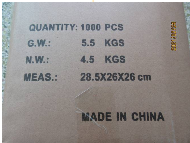
3 side mark.JPG