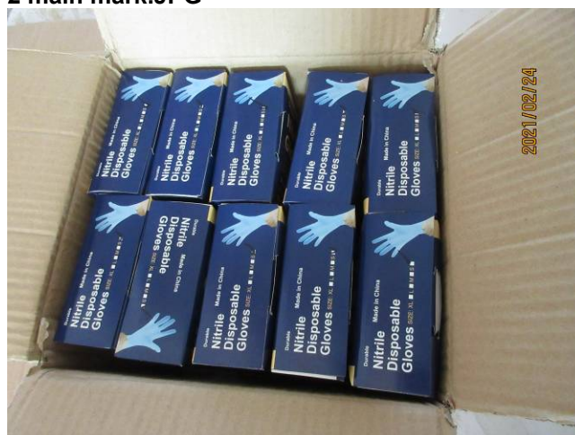
4 open the carton.JPG