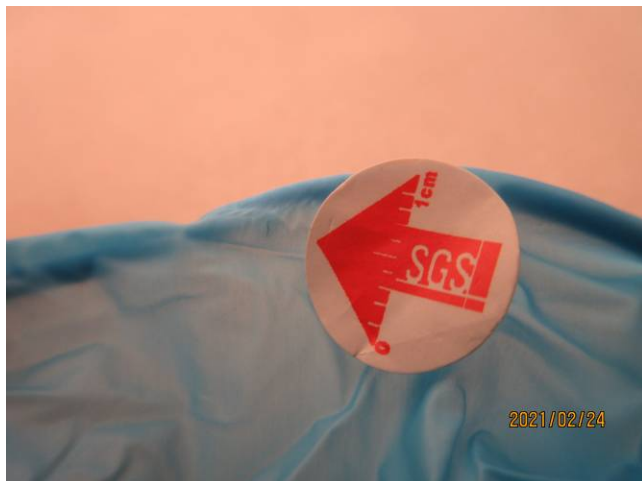
M-def-def- black dot embedded inside gloves-min (1).JPG