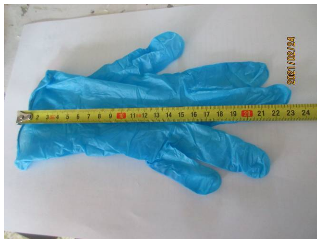
10 size check (1).JPG