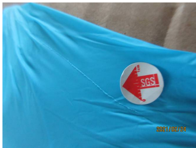
S-def-excess flash mark on the gloves-min.JPG