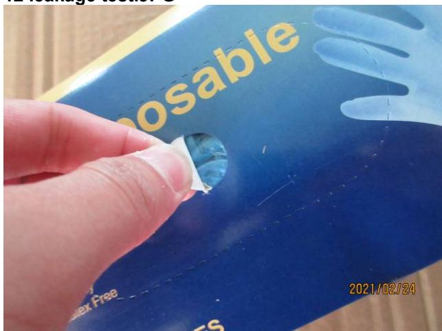
14 function test (1).JPG