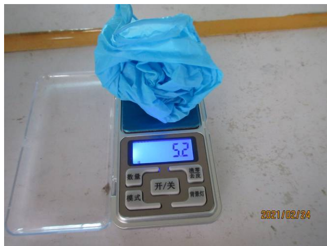
9 weight check (2).JPG