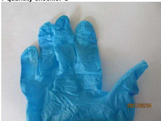
8 product view (2).JPG