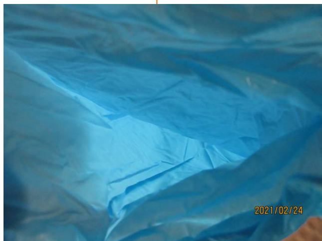
8 product view (4).JPG