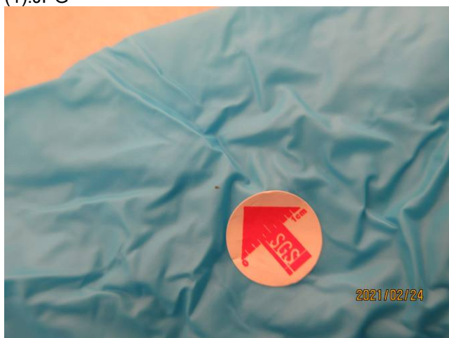
M-def-def- black dot embedded inside gloves-min (3).JPG