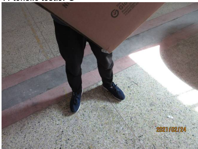
13 carton drop test.JPG