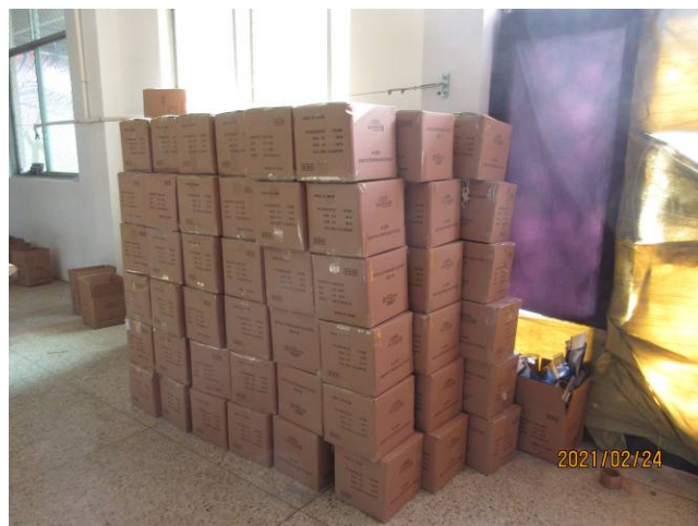
1 storage (2).JPG