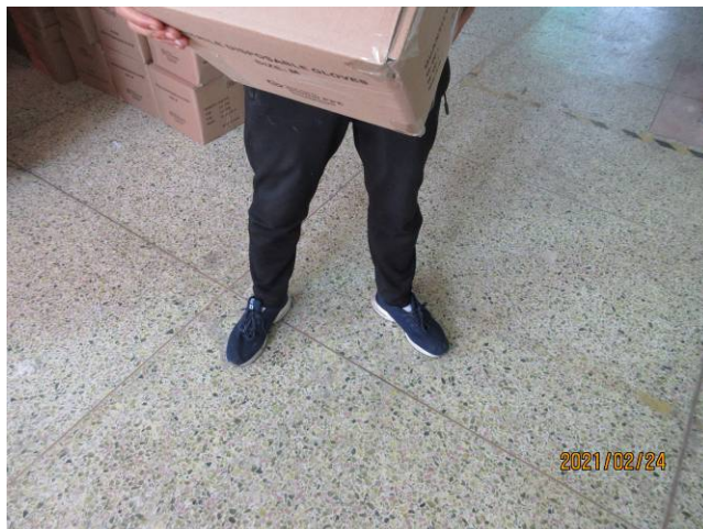
13 carton drop test.JPG