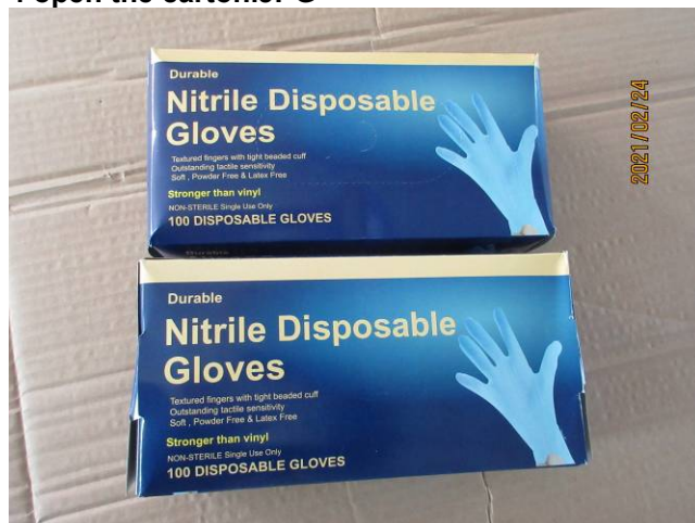
5 color box (2).JPG