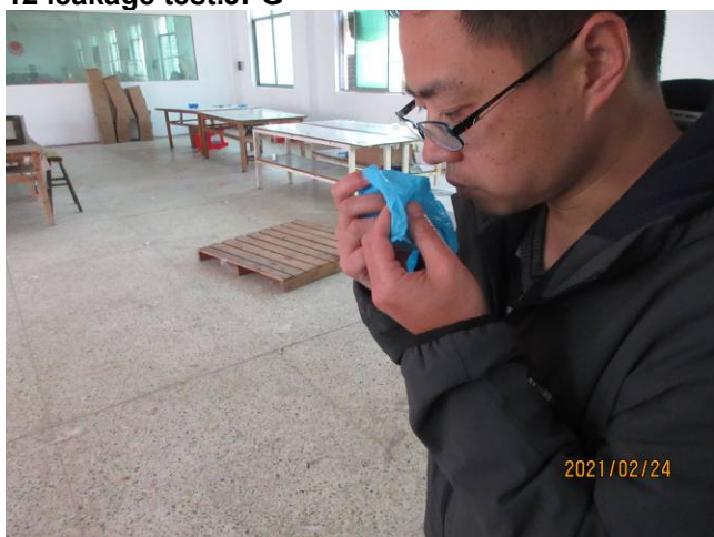
14 smell check.JPG