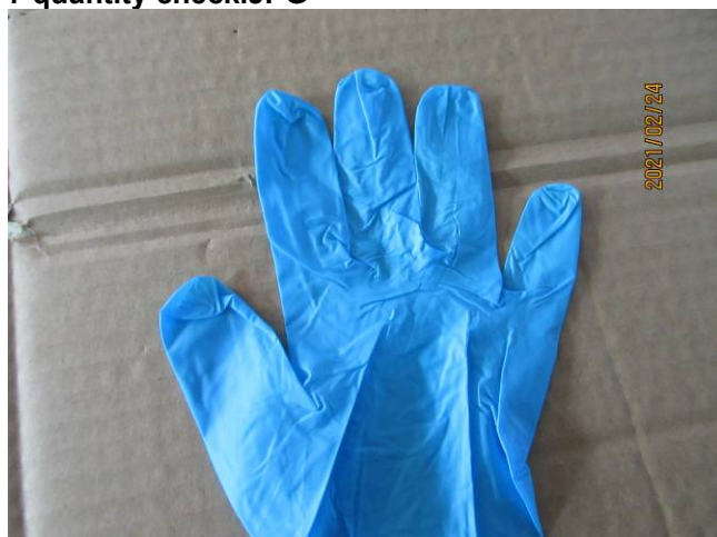
8 product view (2).JPG