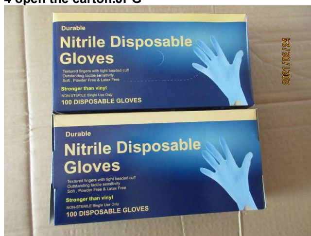
5 color box (2).JPG