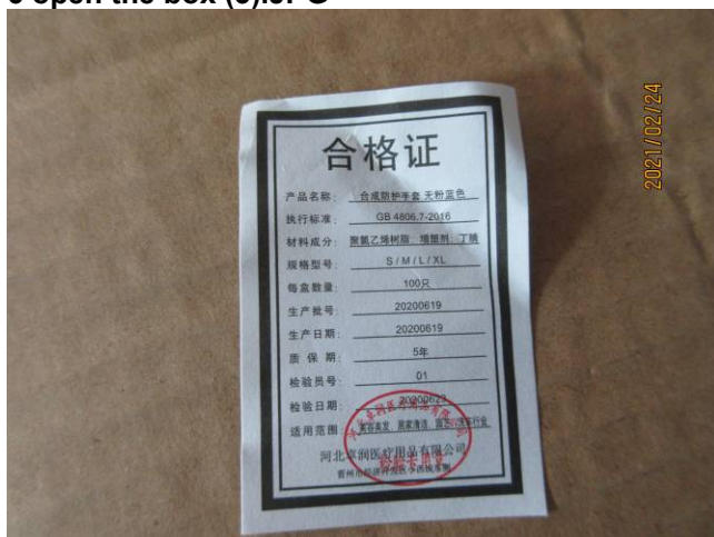
6 open the box (5).JPG