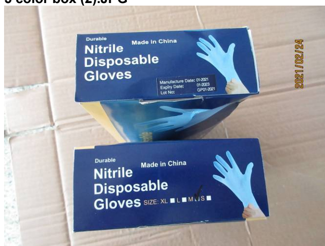
5 color box (4).JPG