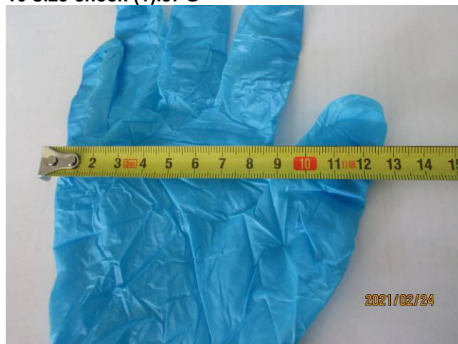
10 size check (3).JPG