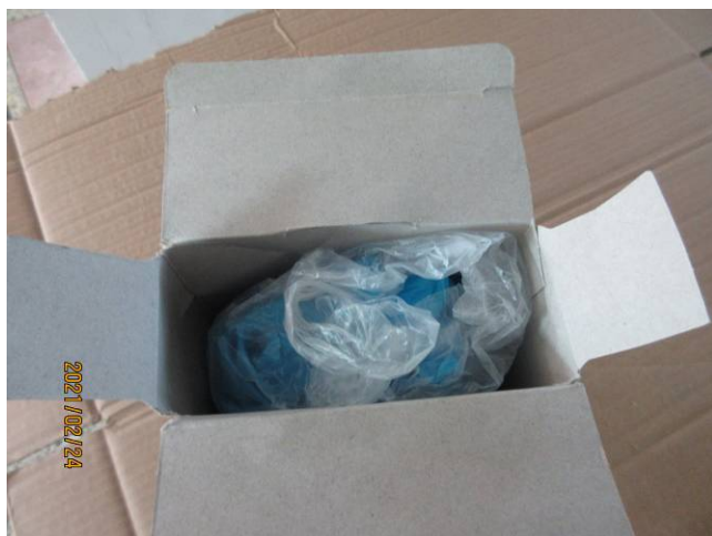
6 open the box (1).JPG