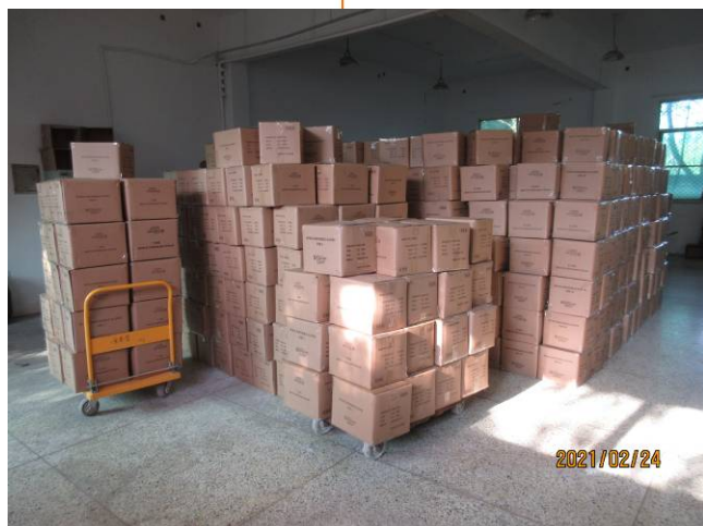
1 storage (1).JPG