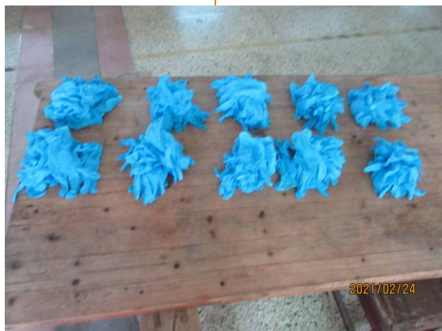
6 open the box (5).JPG