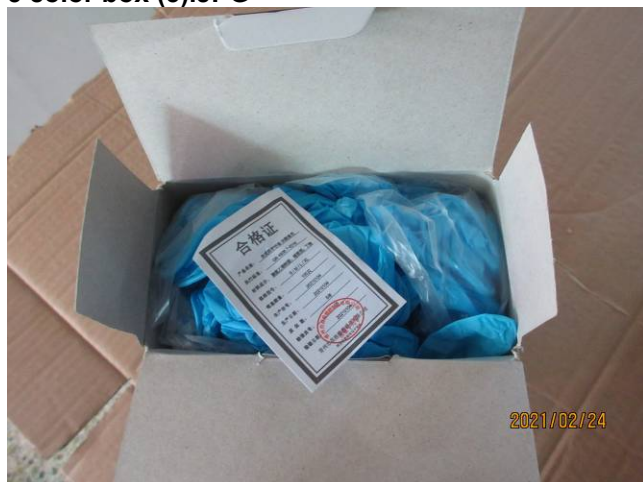
6 open the box (1).JPG