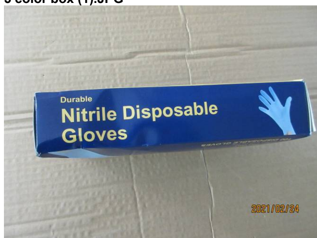
5 color box (3).JPG