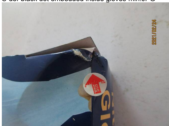
S-def-obviously torn mark on color box-major.JPG