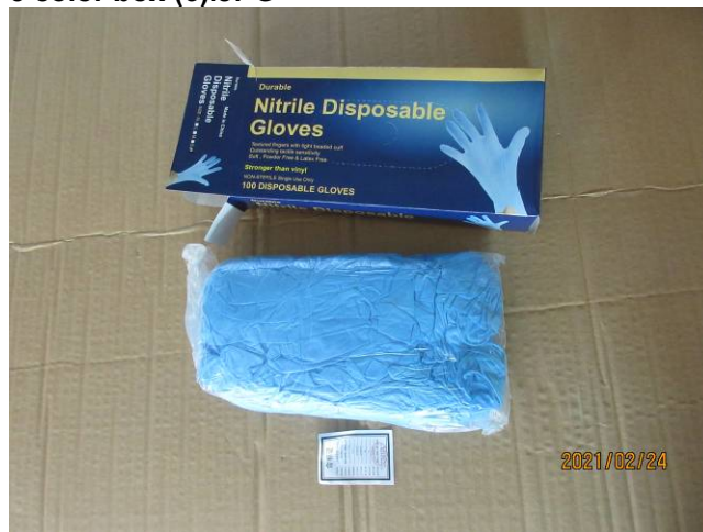
6 open the box (2).JPG