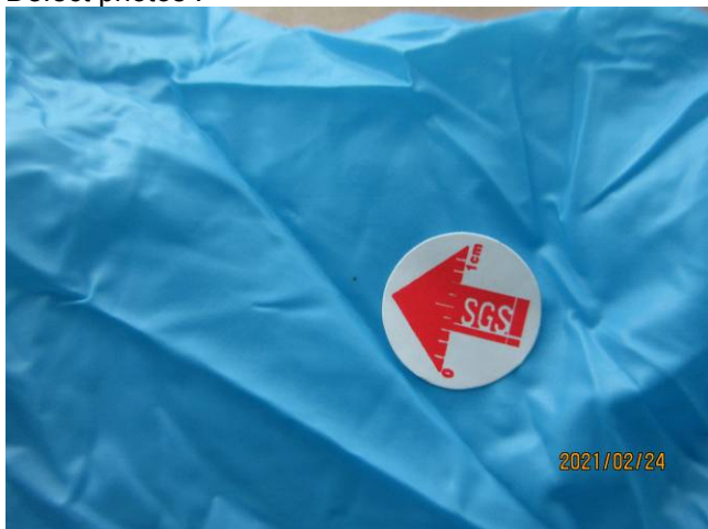
L-def-black dot embedded inside gloves-min (1).JPG