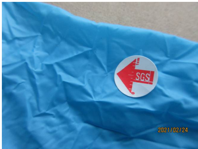
L-def-black dot embedded inside gloves-min (2).JPG