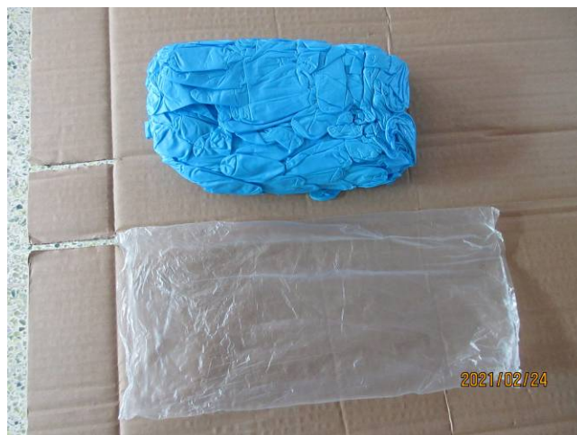
6 open the box (4).JPG