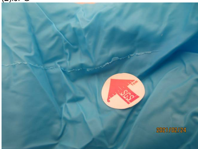
M-def-excess flash mark on the gloves-min.JPG