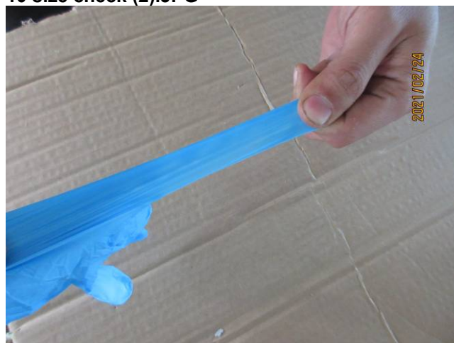
11 tensile test (2).JPG