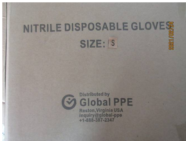
2 main mark.JPG