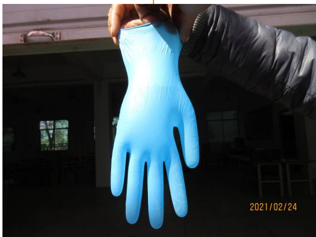
12 leakage test.JPG