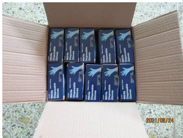
4 open the carton.JPG