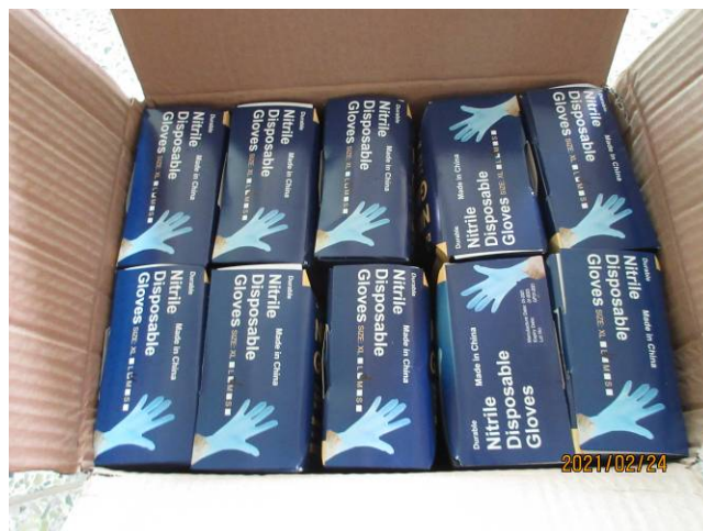
4 open the carton.JPG