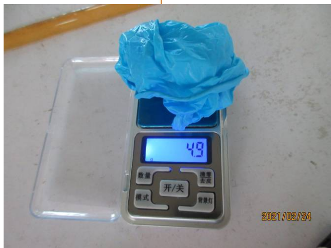
9 weight check (2).JPG