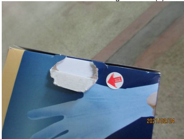
L-def-obviously torn mark on color box-major.JPG