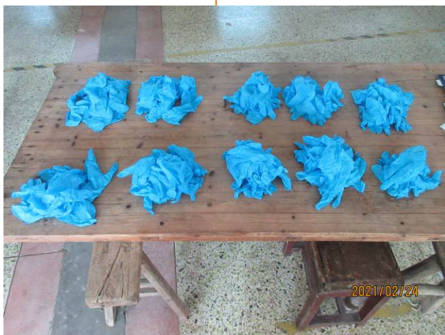
7 quantity check.JPG