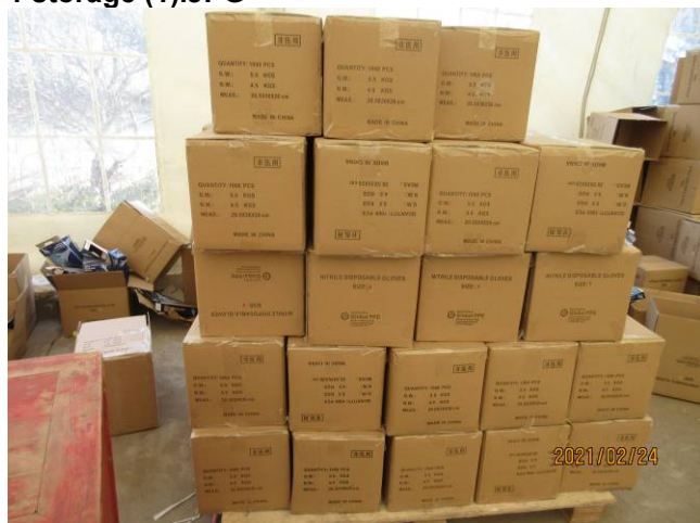
1 storage (3).JPG