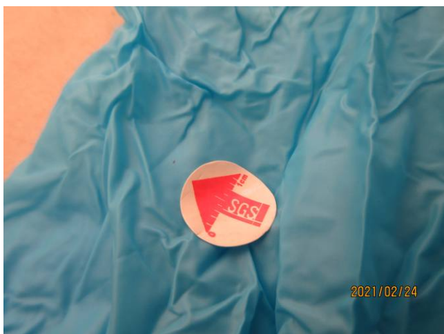
M-def-def- black dot embedded inside gloves-min (2).JPG