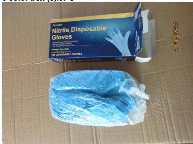
6 open the box (2).JPG