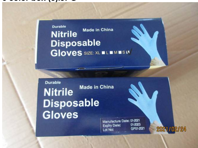
5 color box (5).JPG