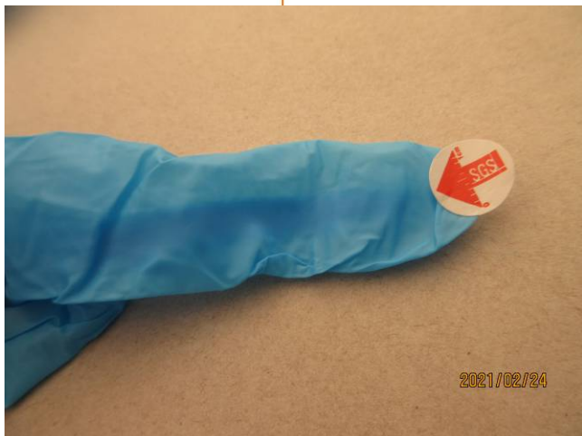
M-def-color deviation on the finger-min.JPG