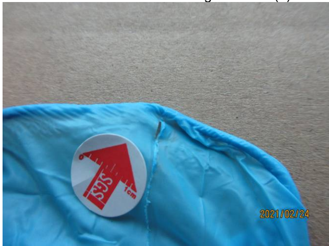
L-def-broken mark on the gloves-maj.JPG