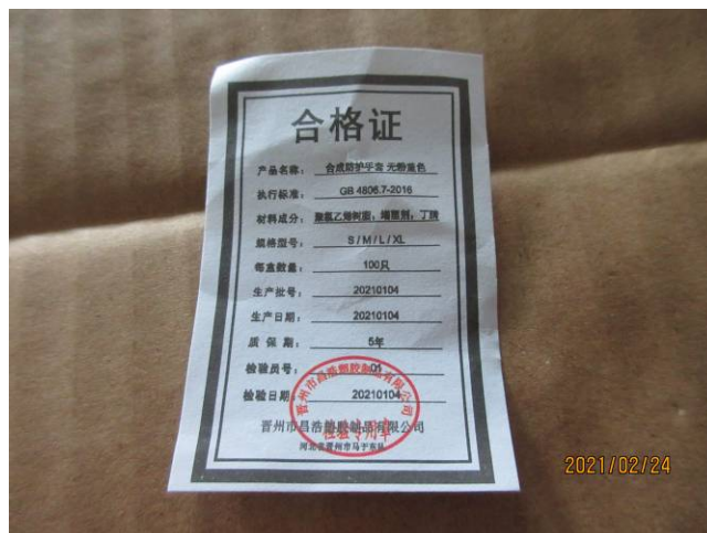
6 open the box (6).JPG