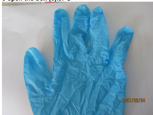
8 product view (2).JPG