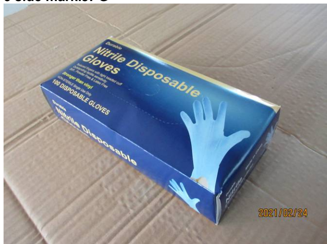
5 color box (1).JPG