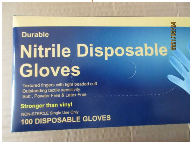
5 color box (3).JPG