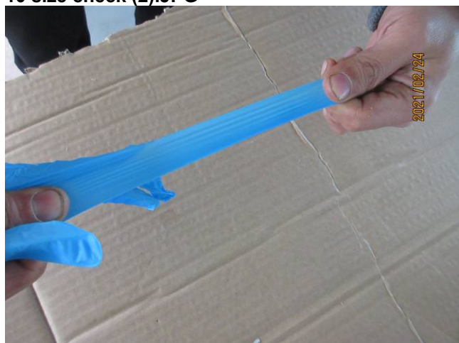
11 tensile test (1).JPG