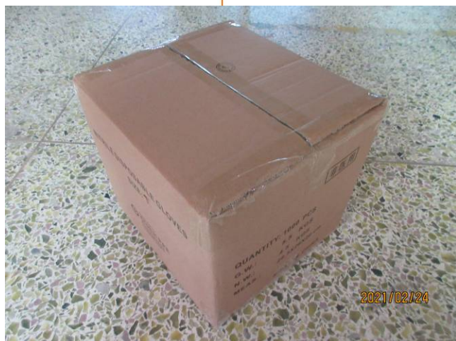
1 carton view.JPG