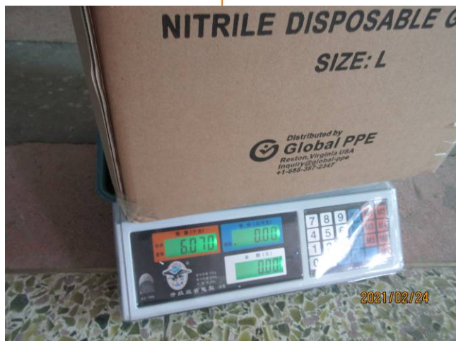
9 weight check (1).JPG