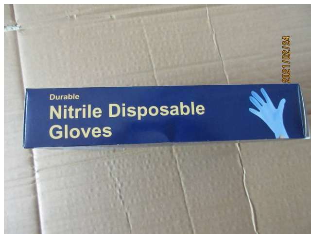
5 color box (4).JPG