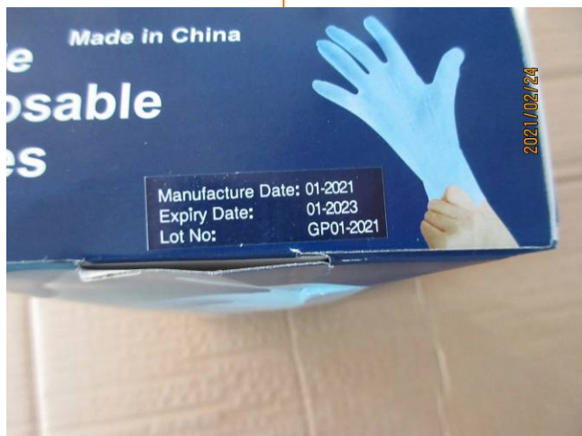
5 color box (5).JPG