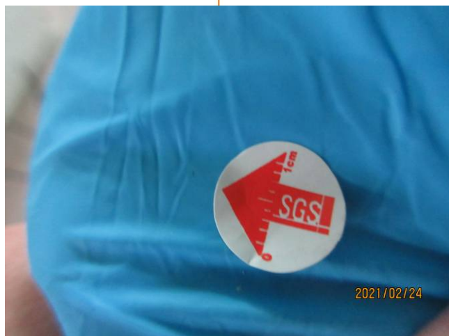
S-def-black dot embedded inside gloves-min.JPG