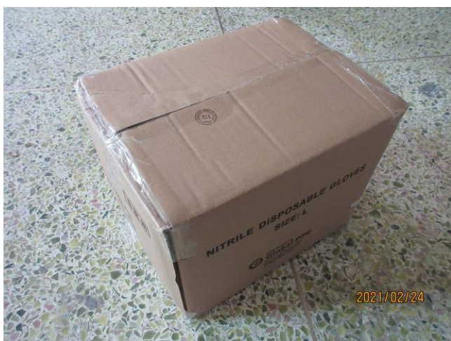
1 carton view.JPG