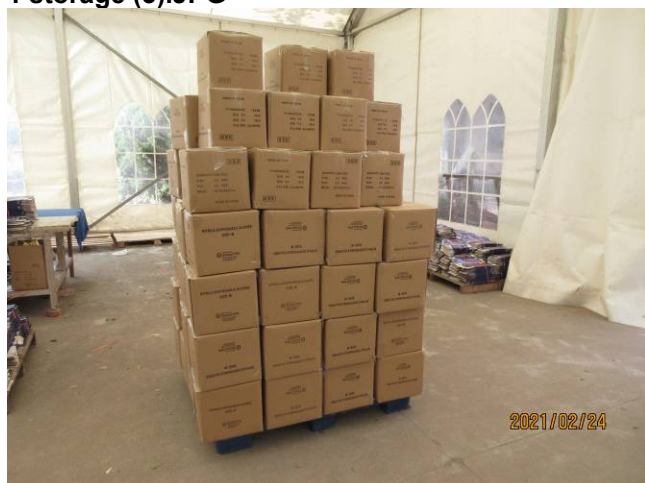
1 storage (5).JPG