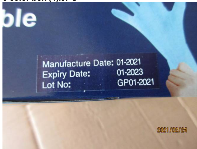
5 color box (6).JPG