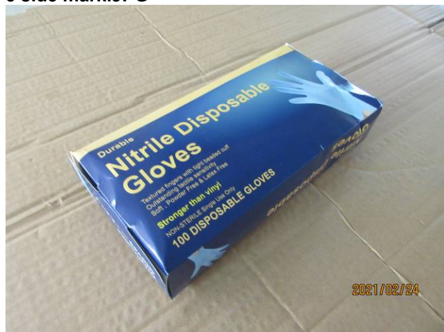
5 color box (1).JPG