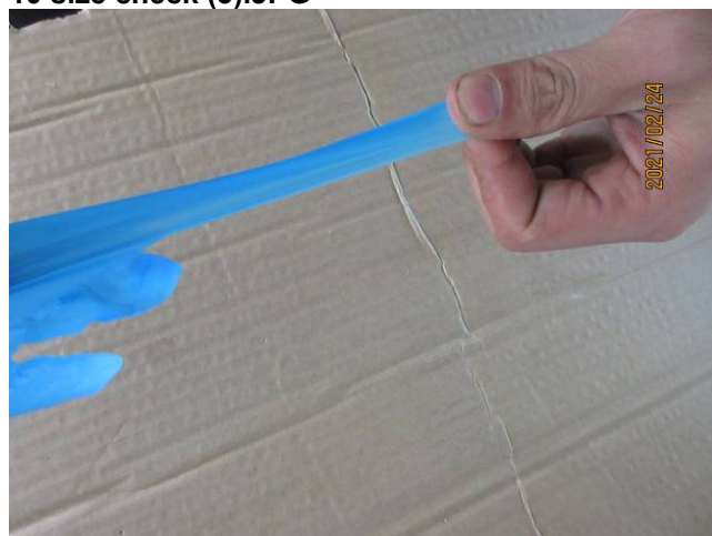
11 tensile test (2).JPG