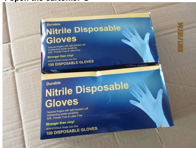
5 color box (2).JPG