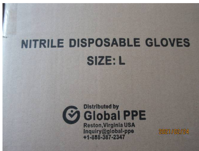
2 main mark.JPG