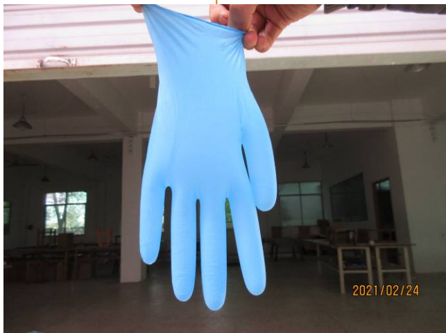
12 leakage test.JPG