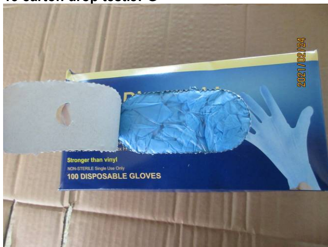
14 function test (2).JPG