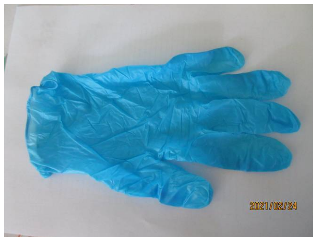
8 product view (1).JPG