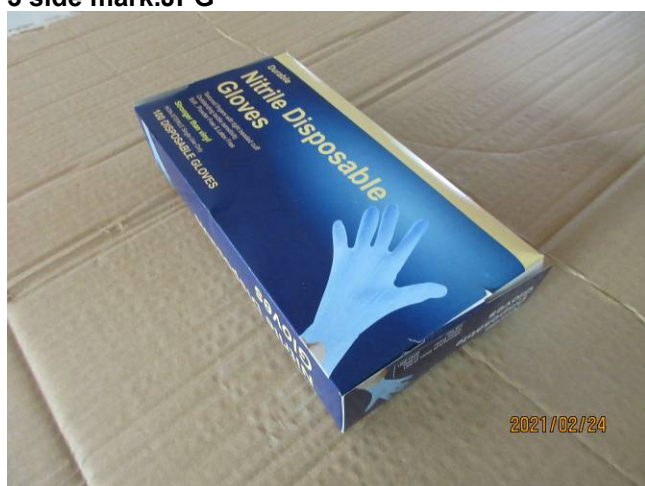
5 color box (1).JPG