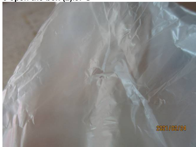
6 open the box (4).JPG