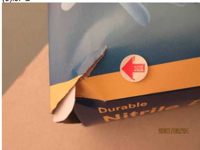
M-def-obviously torn mark on color box-major.JPG