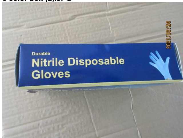
5 color box (4).JPG