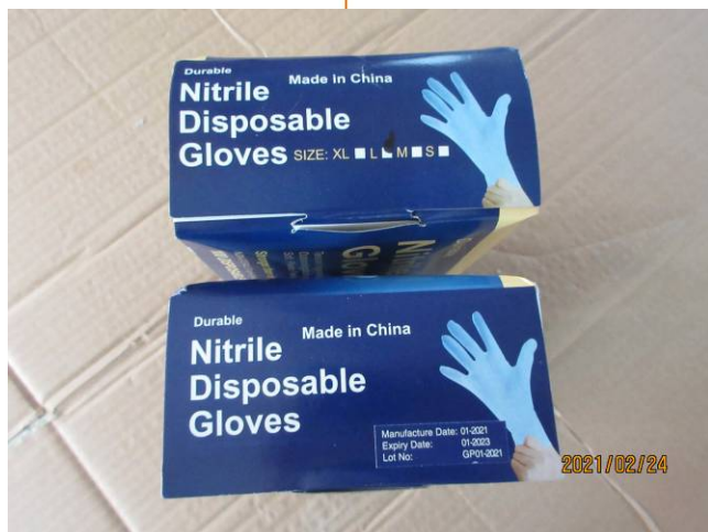
5 color box (5).JPG