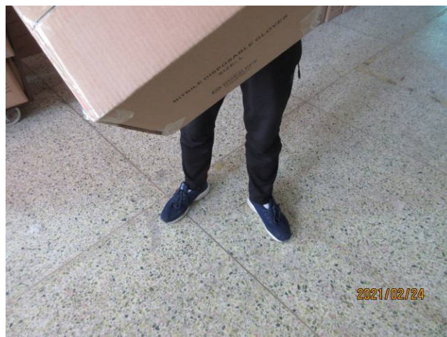
13 carton drop test.JPG