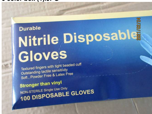
5 color box (3).JPG