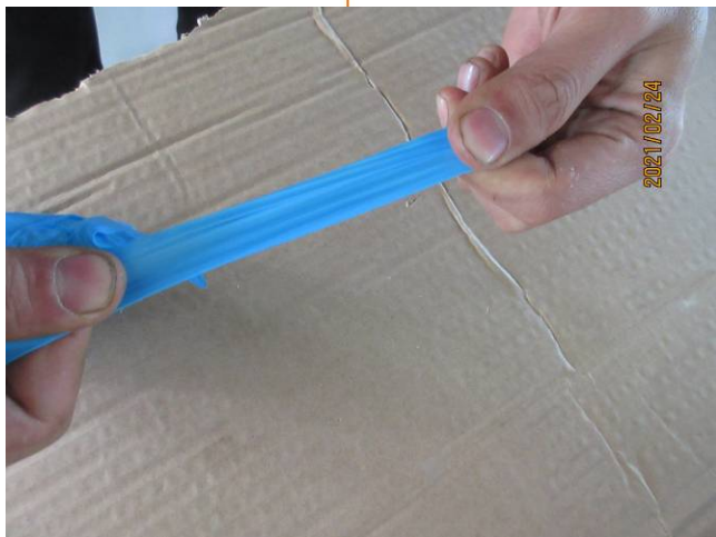
11 tensile test.JPG