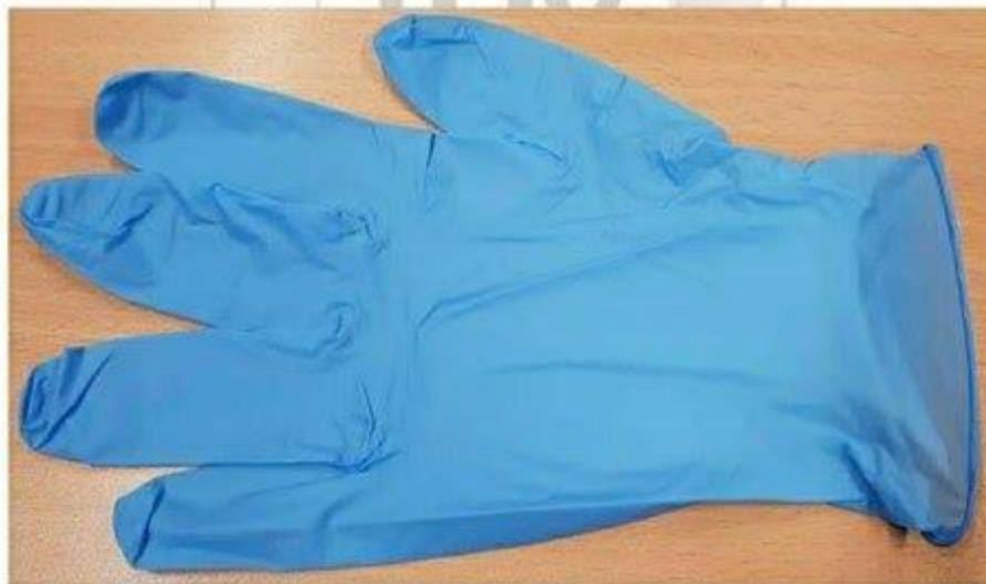
Photo : Powder Free Nitrile Examination Gloves, BS0002