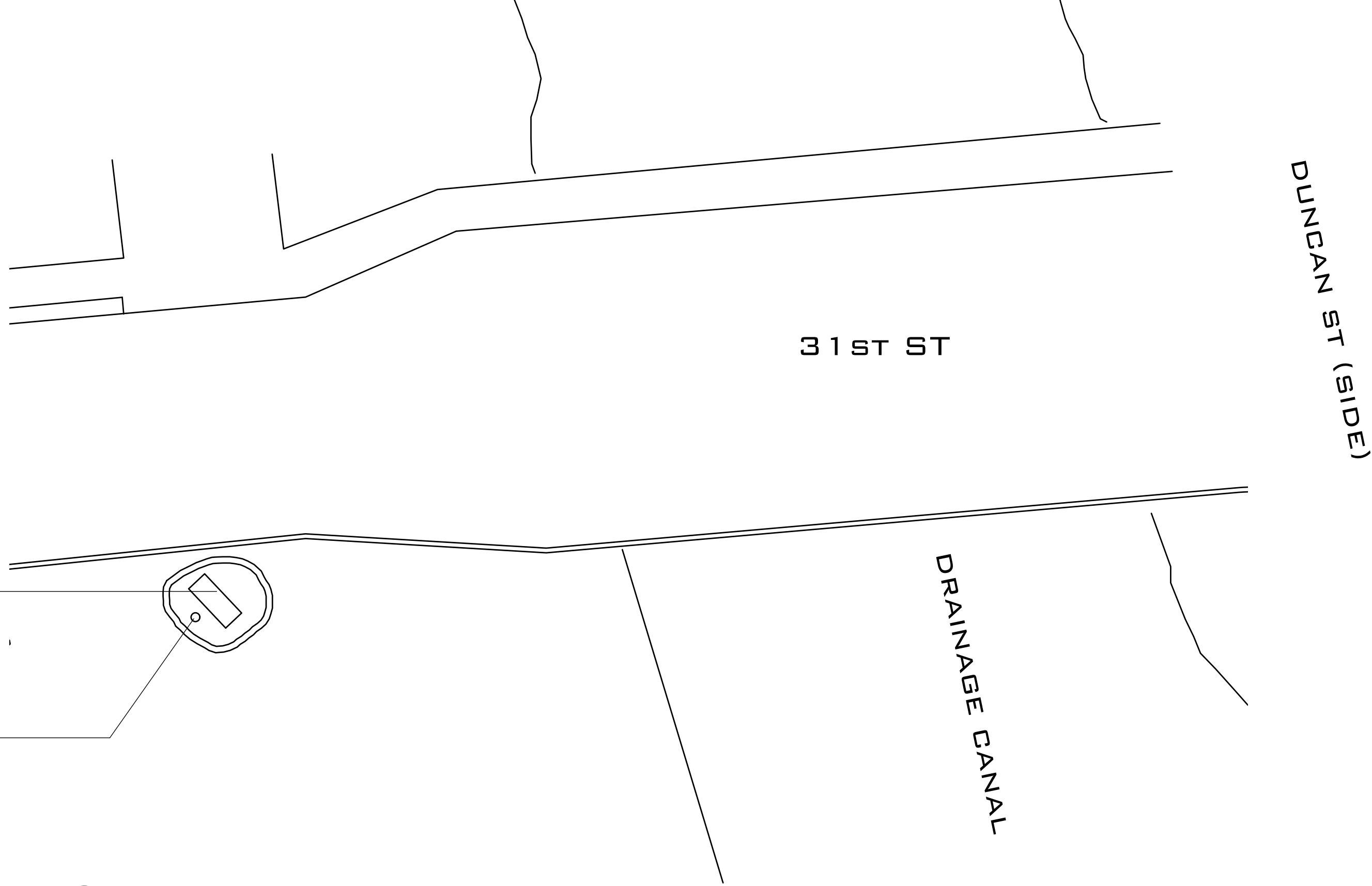
2 PLAN VIEW 1 NOT TO SCALE