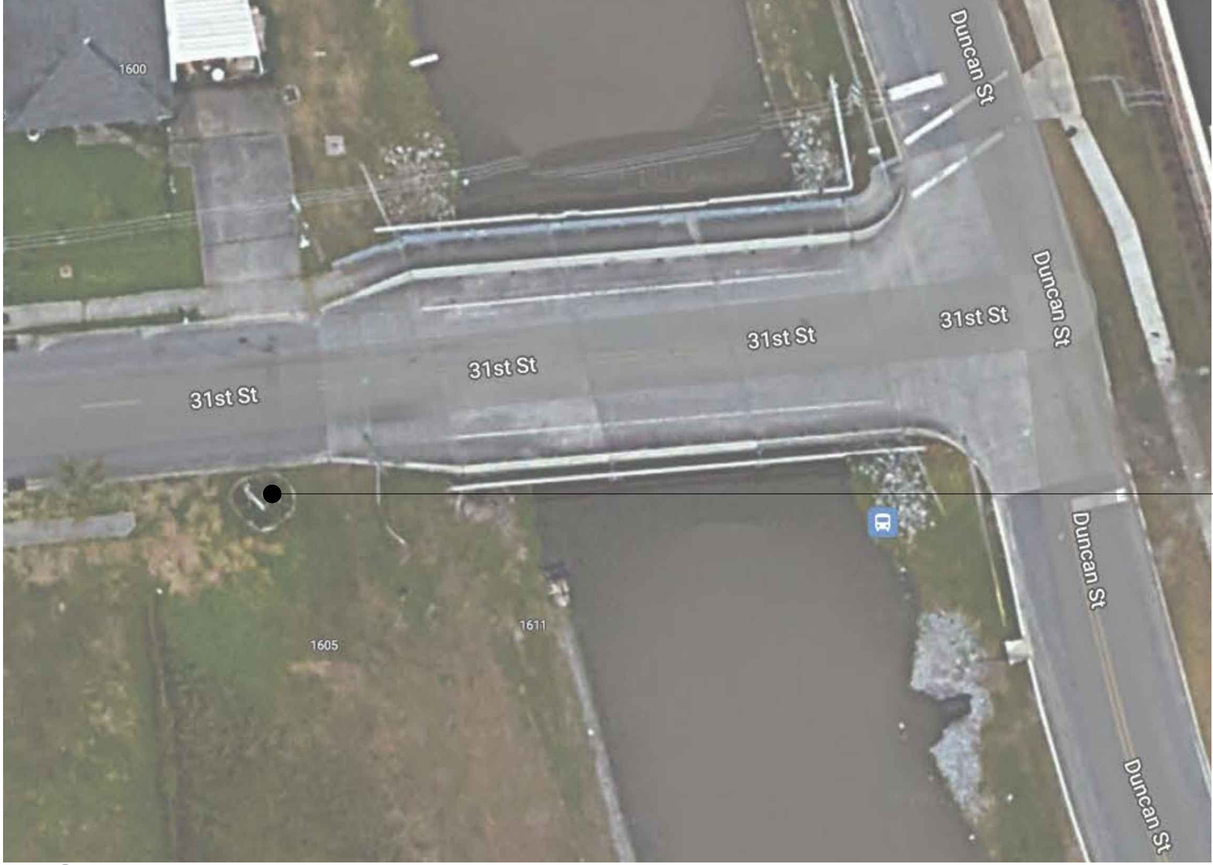
1 LOCATION MAP 1 NOT TO SCALE

PROJECT SITE SALVAGE EXISTING SIGN / FLAG POLE TO REMAIN RETURN SIGN TO THE JEFFERSON PARKWAYS DEPARTMENT