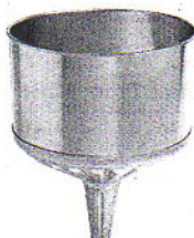
Galvanized Steel Funnel

Capacity indicates what the funnel will hold when the outlet is blocked