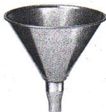
Galvanized Steel Funnel