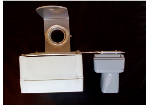
Top View: Mounted on a U Bracket