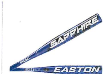
EASTON Easton Sapphire Fastpitch Bat (-12) 2025