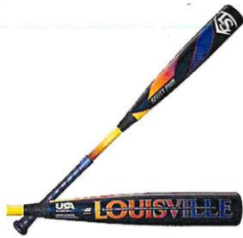
LOUISVILLE SLUGGER Louisville Slugger Select Power USA Baseball Bat (-8) 2025