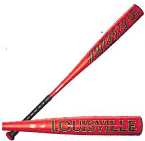
LOUISVILLE SLUGGER Louisville Slugger Dynasty BBCOR Baseball Bat (-3) 2025