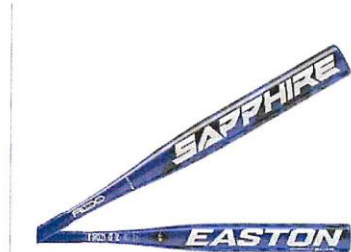
EASTON Easton Sapphire Fastpitch Bat (-12) 2025