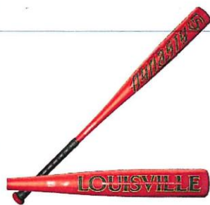
LOUISVILLE SLUGGER Louisville Slugger Dynasty BBCOR Baseball Bat (-3) 2025