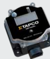
BLINKERBEAM® WIRELESS RADIO