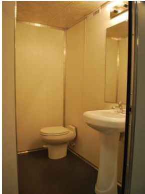
Example of Basic Interior (White FRP) with coin rubber and wash down package