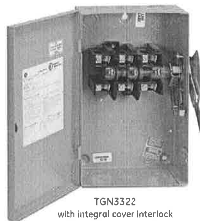
TGN3322 with integral cover interlock