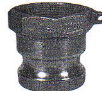
unplated malleable iron