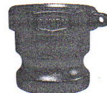
plated malleable iron