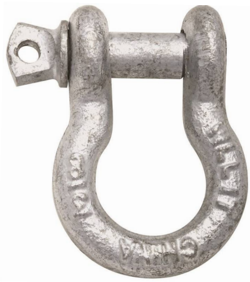
National Hardware 3250BC Series N223-685 Anchor Shackle, 2000 lb Weight Capacity, Galvanized Steel BHMA A138.18 Certified

DeWALT DW1132 Jobber Bit Drill Bit, Parabolic Flute, 4-1/2 in L Flute, Round Shank, 1-1/2 in L Shank Type:General Purpose, Heavy Duty Diameter:1/2 in Flute Type:Parabolic Point Angle:135 deg Point Type:Split Material:High Speed Steel Finish:Black Oxide Applicable Materials:Wood, Metal, Fiberglass, PVC, Stainless Steel Features 135 deg split provides greater durability to reduce breaking Black oxide for greater wear resistance Tapered web eliminates the frustration of bit spinning in the chuck Patented core diameter reduces breakage